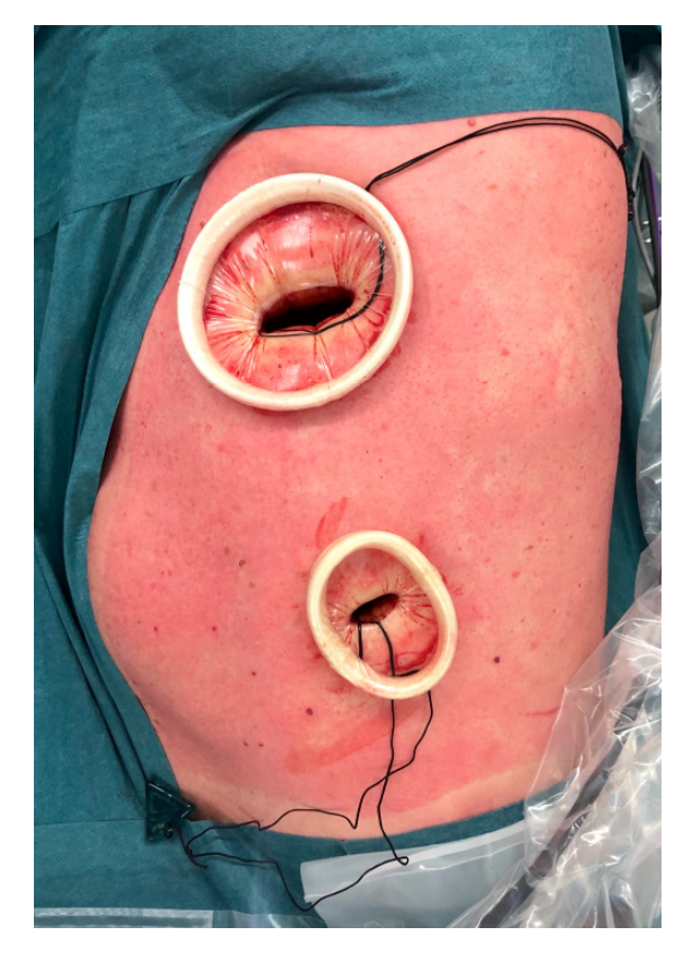
Figure 1. VATS approach with two incisions. A utility incision performed in the 4th intercostal space and a video-port at the 7th intercostal space.

All surgery was performed in lateral decubitus position with single lung ventilation and general anaesthesia. VATS lobectomies were performed through two incisions: a 15-mm video-port in the 7th or 8th intercostal space in the mid-axillary line where the 30^{\circ} camera was placed through a soft tissue retractor (Alexis, xs, Applied Medical, California) and a 30-mm utility incision was performed in the anterior axillary line in the 4th or 5th intercostal space and another soft tissue retractor (Alexis, s, Applied Medical) was placed (Figure 1). RATS lobectomies were performed using DaVinci robot surgery system type Xi (Intuitive, California) with a four arms approach. It was carried out through a utility incision at the fourth intercostal space and three additional ports without CO<sub>2</sub> use, according to the Park-Veronesi technique. (Figure 2).