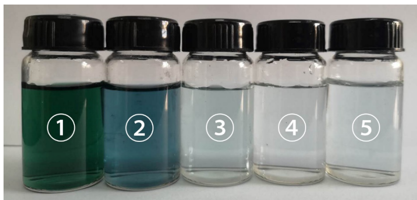
Figure S1. Comparisons of the photograph of \text{Cr}^{3+} wastewater before and after treatment: ① origin wastewater, ② after pH adjustment; effluent of ③ TFC, ④ TFN and ⑤ CM membranes.