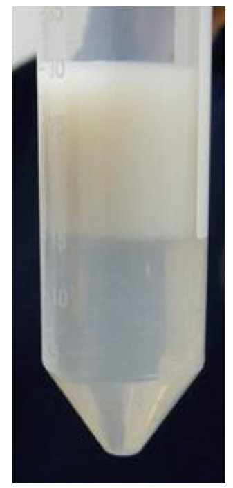
Figure 1. Single-layer centrifugation of stallion semen using Androcoll-E.

Note: the 50-mL centrifuge tube contains 15 mL of extended stallion semen (at a sperm concentration of not more than 100 \times 10^{6} /mL) carefully pipetted on top of the ready-to-use colloid formulation, Androcoll-E.