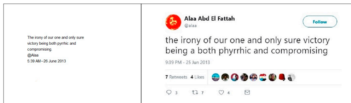
Figure 4. (Left) p. 183 of The City Always Wins ; (Right) Alaa tweet about a ‘pyrrhic [sic] victory’. 25 June 2013.

As Mason (2013) demonstrates, YouTube played an important role in global uprisings as an evidence broadcasting site. If it was Facebook that publicized Khaled Said’s murder by torture, it was his attempt to upload a video documenting police corruption that triggered that torture in the first place. Launched in 2005, the video-sharing site rapidly attracted both controversy and a vast number of clicks. Over time, it was put to action holding the mighty accountable for their transgressions,