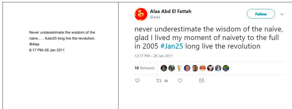
Figure 2. (Left) p. 3 of The City Always Wins ; (Right) Alaa tweet about ‘the wisdom of the naive’. 28 January 2011.