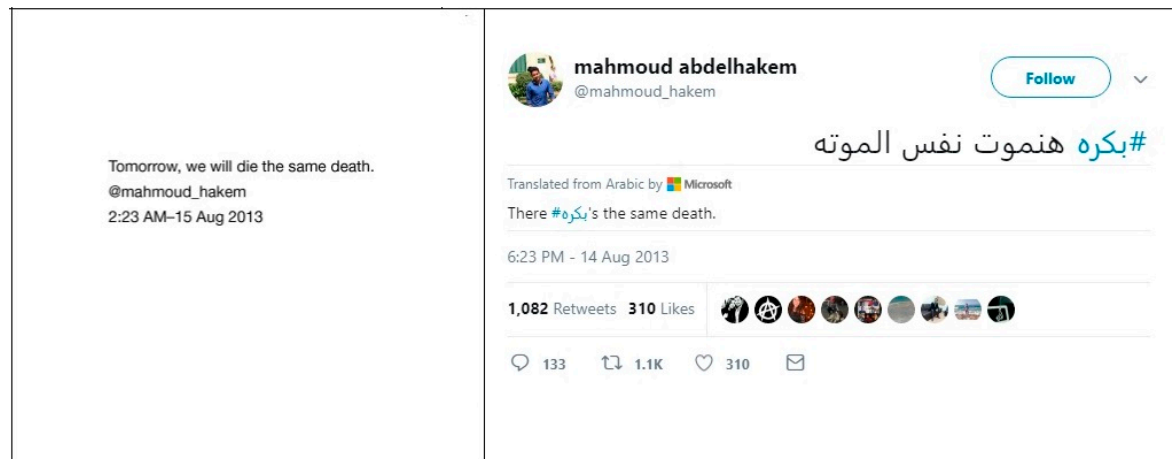
Figure 3. (Left) p. 209 of The City Always Wins ; (Right) Mahmoud Abdelhakem tweet about dying ‘the same death’ at the Rabaa massacre. The Arabic hashtag, left untranslated by Microsoft Translate, means #tomorrow. 14 August 2013.