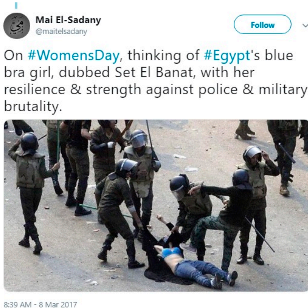
Figure 5. Mai El-Saday tweet with picture of ‘blue bra girl’. 8 March 2017.

corrects an older relative for her inaccurate diction when the latter claims that the young woman and her friends use particular language ‘on the Face’ (Hamilton 2017a, p. 155), behind the humour are signals that Facebook political chatter is far removed from most Egyptians’ daily concerns.