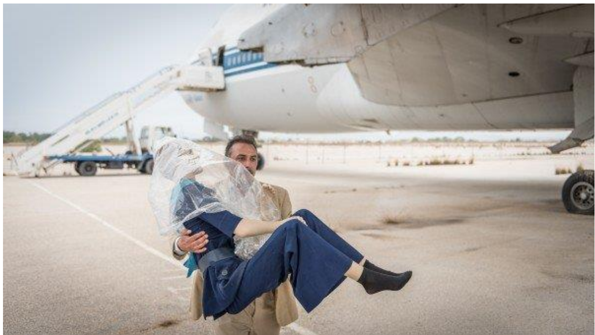
Figure 3. Naeem Mohaiemen, still from Tripoli Cancelled , 2017, digital video (color, sound), 95 min. © 2017 Naeem Mohaiemen. Courtesy of the artist and Experimenter, Kolkata.