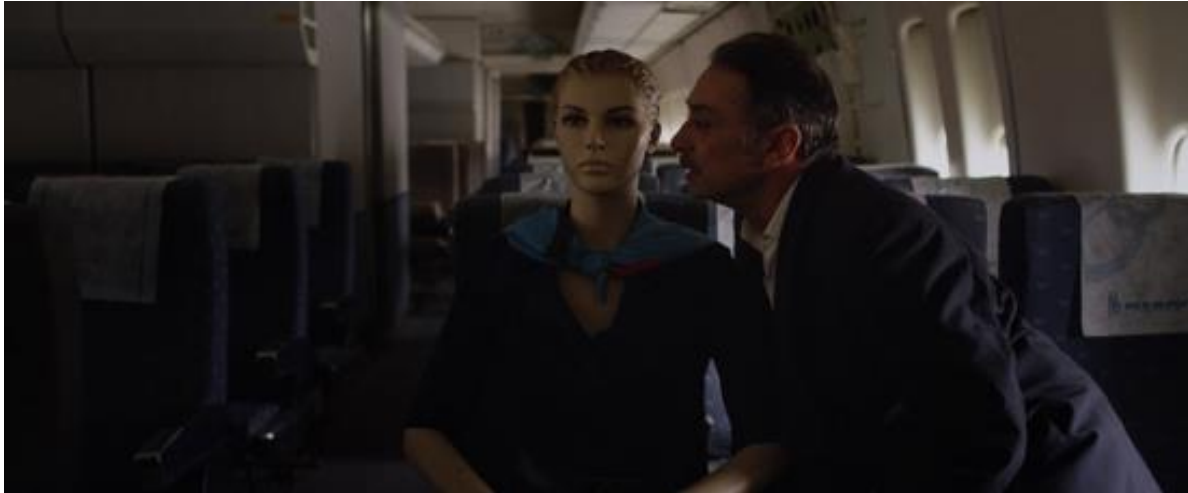
Figure 2. Naeem Mohaiemen, still from Tripoli Cancelled , 2017, digital video (color, sound), 95 min.

at the Galerie des Beaux-Arts in Paris—poses with a headless mannequin in his arms. 1 How might we understand the significance of a reference to the interwar Parisian avant-garde in a narrative anchored in the ethics and aesthetics of postwar cosmopolitanism? One possible answer can be excavated from within the film itself.