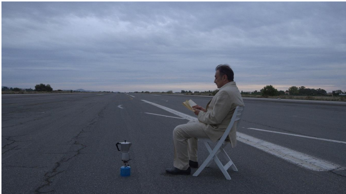
Figure 1. Naeem Mohaiemen, still from Tripoli Cancelled , 2017, digital video (color, sound), 95 min. © 2017 Naeem Mohaiemen. Courtesy of the artist and Experimenter, Kolkata.

Other scenes point more directly to the liminal space the protagonist inhabits. In one such instance, the protagonist can be seen sifting through a dusty pile of discarded boarding passes on the floor. While the voluminous amount of information (names, destinations, dates, etc.) found in this archive of sorts alludes to the hustle and bustle of millions of journeys that traversed the historic hub, the boarding passes' dusty state calls to mind Carolyn Steedman's view of dust as an essential element of the historian's 'archival romance' (Steedman 2001), thus placing the space's vivacity clearly and decidedly in the past. In another such instance, the protagonist can be seen sitting in the cockpit of an abandoned helicopter, acting out the pilot's gestures, complete with the requisite sound effects, in what appears to be a burst of childish spontaneity. This sudden demonstration of conviction in the protagonist's make-believe may symbolize his (desperate) attempt to exercise control over his destiny, a desire that remains elusive throughout the film.