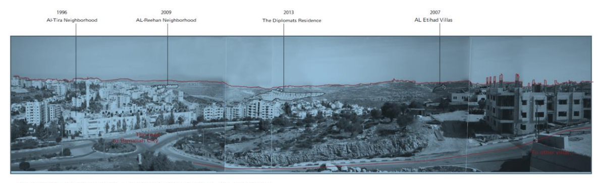
Panorama of Al-Tira neighborhood. A new expansion of Ramallah city, the image shows -as appears in the background- examples of the new neighborhoods on the preiphery.