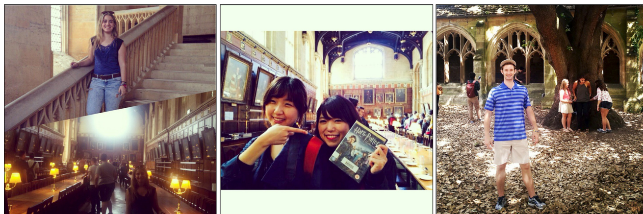
Figure 3. Instagram photos posted by Harry Potter fans in Oxford [28–30].

(hash)tagged with key words such as “#harrypotter” or “#hogwartsismyhome”. They are also localized, both via the tag “#oxford” and because, as with the Flickr photos taken by fans of Inspector Morse , they can be presented in the form of a map. Therefore Instagram and its fellow image-sharing services together posit a global map of experience which becomes increasingly deeper as the services mature and accumulate. There is much further research to be done on this subject in order to uncover the riches of these visual sources.