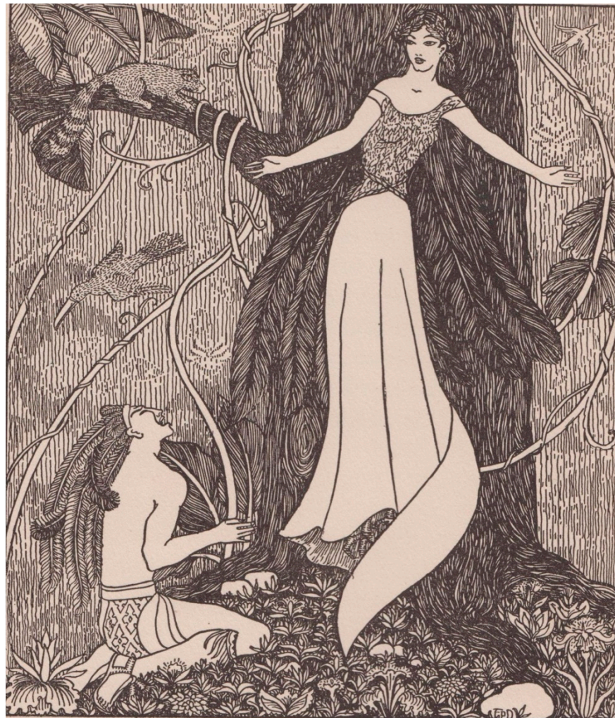
Figure 3. Frances Purnell Dehlsen's illustration of the "Jungle Witch" (the Xtabay) from Idella Purnell's (1931, p. 29). In the Public Domain.