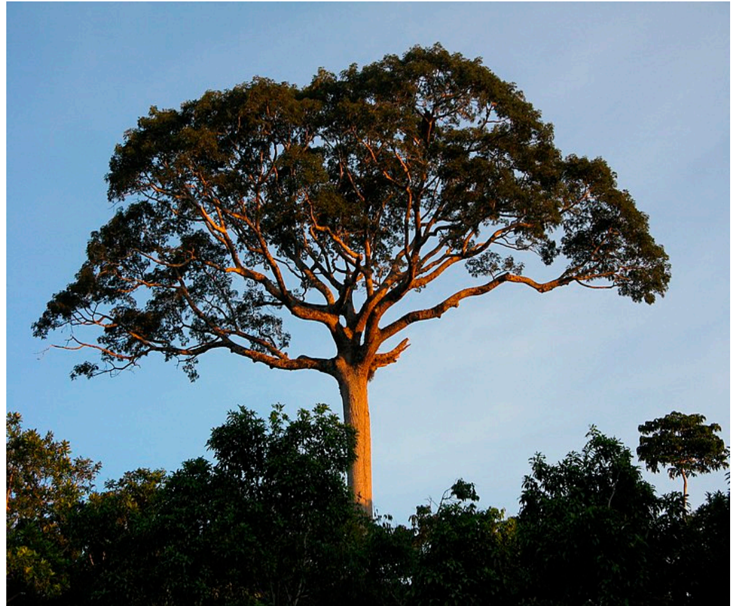
Figure 1. Photo by Klaus Schöntzer, “Ein Lupuna-Baum ( Ceiba pentandra ), das Wahrzeichen der Forschungsstation Panguana.” 2008. Available under a GNU Free Documentation License.

ceiba tree taps an earlier, hence more “authentic”, version of the Xtabay than other variants, but her eerie otherworld charm continues to inspire and renew her legend. Discussion of that legend’s ancient sources and modern expressions follows the poem.