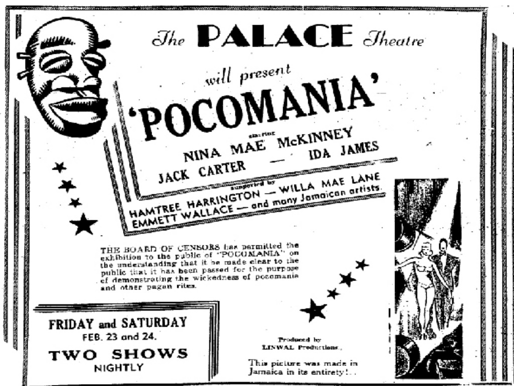
Figure 7. An advertisement for the screening of The Devil's Daughter in Jamaica, where the film was named Pocomania , featuring the decision of the British Board of Censors (JG, 14 February 1940).

In early twentieth-century Jamaica, the licensing authority typically consisted of a small group of four people made up of (former) policemen and educational and legislative officials. They were to give permission to the theatrical exhibition of hundreds of films that were annually imported, mainly fictional films from the United States. As per usual, they followed the verdict of the Board of Censors and paid extra attention to 'the undesirable effects produced by the exhibition of certain types of cinematograph films in the Colonies' (Circular Despatch 1927). In the case of Pocomania , the Board of Censors had informed the Jamaican licensing authority that the film was allowed to be screened on the island with the proviso that it would be used to teach the local population about the malice of pocomania and other African-Caribbean religions on the island. Therefore, in the newspaper advertisement in support of the first screenings of Pocomania in Kingston in February 1940, it was not only explicitly stated that the film was 'made in Jamaica in its entirety', but also that the Board of Censors had merely 'permitted the exhibition to the public (...) on the understanding that it made clear to the public that it has been passed for the purpose of demonstrating the wickedness of pocomania and other pagan rites' (JG, 14 February 1940; Figure 7). Clearly, the condemnation and suppression of African-derived religions remained intact well into the early twentieth century. 36