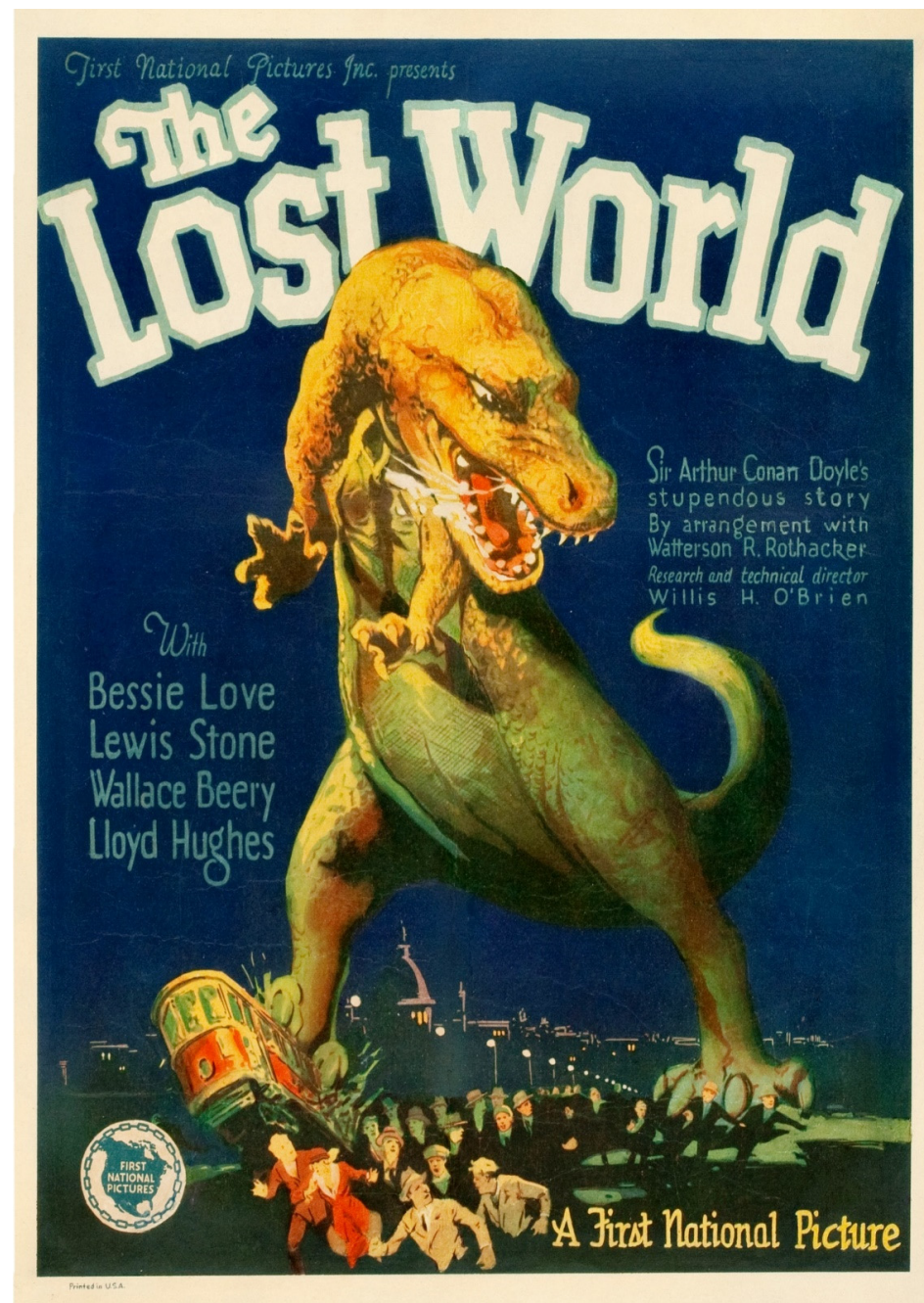
Figure 3. A theatrical release poster of The Lost World , which might have been the first feature-length Hollywood imperial adventure film. The 106-min silent film fashioned many of the basic ingredients and accompanying colonial tropes that would come to dominate the genre. The Lost World was an adaptation of Arthur Conan Doyle's 1912 safari novel of the same name and told the story of a group of British explorers who embark on a scientific expedition to the Amazon jungle in search of pre-historic dinosaurs. Upon arrival at their destination, they hit upon a plateau populated with the creatures. The adventurers manage to bring one back to London with the intention to put him on public display. However, the monster escapes and wreaks havoc on the city before swimming down the Thames. The Lost World , which was advertised with the tagline 'Mighty Prehistoric Monsters Clash with Modern Lovers,' premiered on 2 February 1925 in New York and became an instant domestic box office hit. At the time, Laurence Reed (1925), reporter of the Motion Picture Magazine , lyrically wrote that the film offered 'sheer adventure, and demonstrated that the camera knows no limitations in recording the most fanciful imagination'.