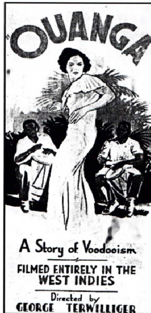
Figure 5. A 1935 British theatrical release poster of Ouanga , emphasizing the exotic savagery of the black population of the West Indies.

(JG, 25 October 1933). A few days later, a member of Ouanga Productions reassured the commentator by stating in the newspaper that Ouanga would ‘ridicule voodoo all through’ (JG, 25 October 1933). He explained that ‘the whole script was carefully scrutinised by the authorities in London, and you can be sure that neither they nor the releasing Company, who have immense British interests, would pass anything reflecting at all on a British Colony’ (JG, 25 October 1933). Indeed, as will be shown in the context of The Devil’s Daughter as well, 1930s feature films were highly monitored and customized to safeguard a moralizing view of the British Empire.