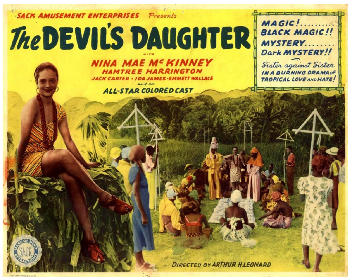
Figure 8. A lobby card of The Devil's Daughter emphasizing 'black magic' as a dark force and the Caribbean tropics as a place of mystery and intrigue. In the United States the film was released on December 7, 1939, and mainly booked in exploitation theatres catering to Africa-American audiences.

(or perhaps because of) the region's nearing achievement of political independence from colonial rule. Particularly, while remaining in the field of low-budget horror moviemaking, Caribbean black magic lingered in the popular Euro-American cinema in the decades that followed. According to Sulikowski (1996, p. 87), early zombie films such as White Zombie , Black Moon , Ouanga , Devil's Daughter and I Walked with a Zombie solidified obeah, voodoo, and other African-Caribbean religions as a general myth of horror in American popular cinema: 'With the first movie[s] featuring zombies the USA invented their own particular topos of cinematic horror to enunciate evil magic, terrors and terrible secrets which are presumed to be the property of black people and their cultures'. Particularly, they established African-derived 'black magic' as a 'part of the visual filmic code' of exploitation horror cinema (Sulikowski 1996, p. 83; Figure 8).