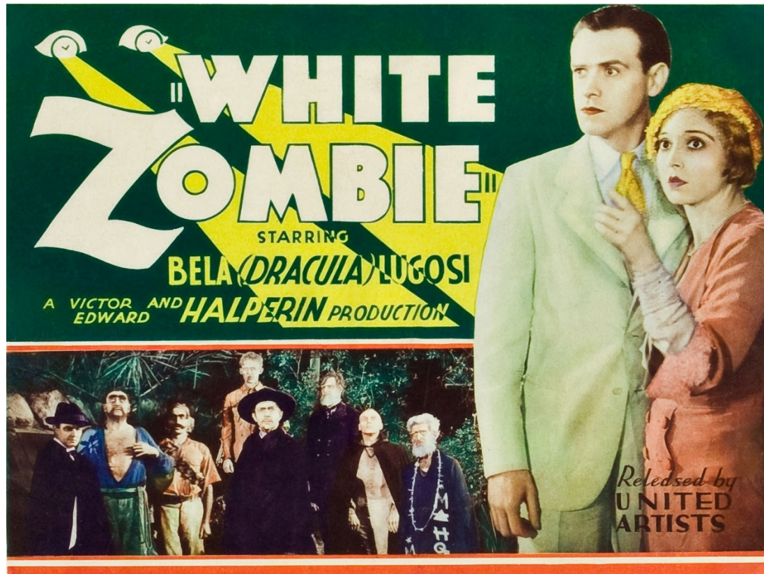
Figure 1. A theatrical release poster of White Zombie , known as the first feature-length zombie film ever made.

became the first feature-length zombie movie to appear on the silver screen (Figure 1). 9 The low-budget film was produced by the independent filmmaking brothers Victor and Edward Halperin and largely shot on the Universal Studios lot in California.