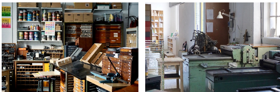
Figure 3. The London Centre for Book Arts: The studio was established in October 2012, becoming the first and only centre of its kind in the country.

available in general print studios, dedicated technical support is required to supervise studio practice and professional conduct concerning the preservation and use of any type collection.