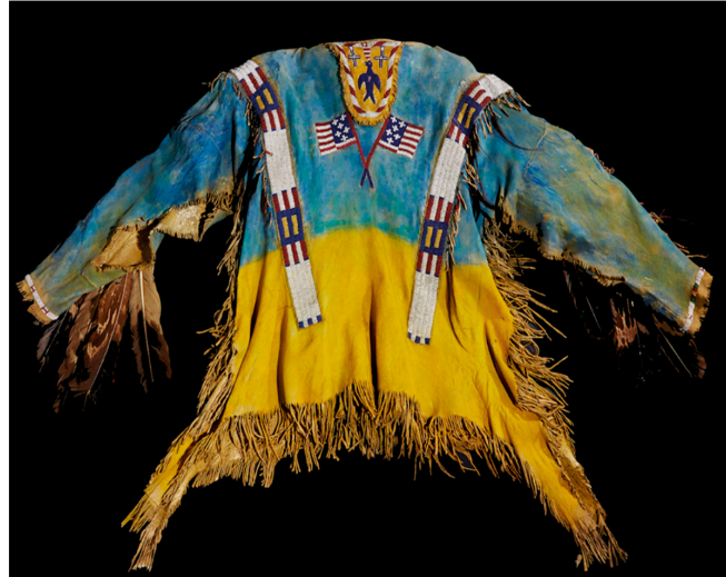
Figure 6. Rear view of Plains Indian buckskin tunic, c. 1888, beadwork, eagle feathers, paint, and quillwork on deerskin. Musée de l'Atelier Rosa-Bonheur, Château de By, Thomery, France. Photograph taken by Christie's Paris. Used by permission of the Musée de l'Atelier Rosa-Bonheur.

beaded US flags in Lakḥóta art (Schmittou and Logan 2002, p. 583). Furthermore, the design is not a star, but a cross motif (Figure 7), as often produced in this flag imagery (Schmittou and Logan 2002, p. 583) and frequently in beadwork. 6