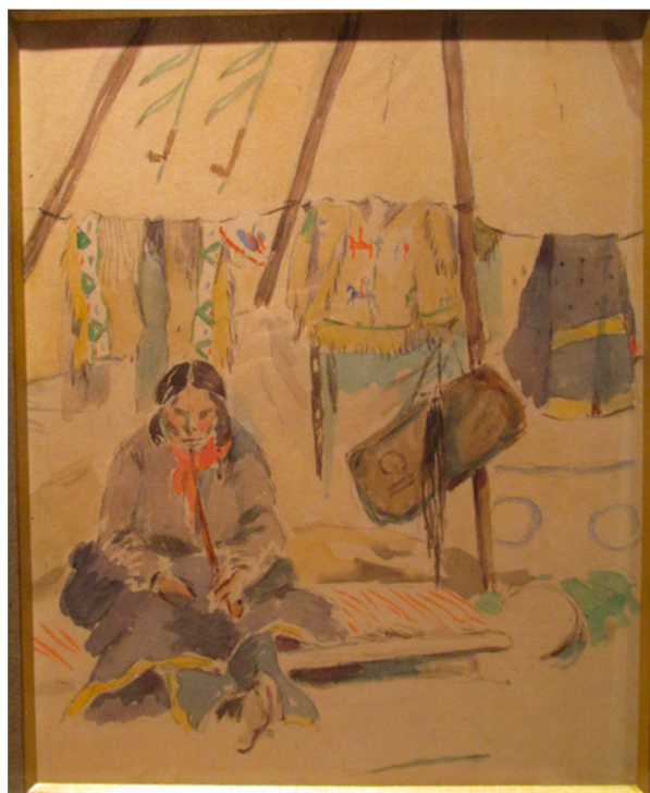
Figure 18. Joë Hamman, Ithúnkasaj Glešká, nd, watercolor, Collection of Jacques and Chantal Nissou, Fontvieille, France.

wearing the jacket in London in 1909 (Figure 12) and at the Jardin d'Acclimatation in 1911 (Figures 13 and 14) as well as doctored photographs of Hamman that replace the background of a Paris garden with tipis (Dubois 1993, p. 27; Burns 2018b, p. 45). 11 While narrative beadwork depicting figures on horseback became common in this period, no two identical beaded jackets are extant. Hamman commemorated his unlikely story in a later watercolor imagining Ithúnkasaj Glešká contemplatively smoking a long pipe inside a tipi, with the regalia hanging on a line behind him as though the warrior was resting before the laurels of his narrated past (Figure 18).