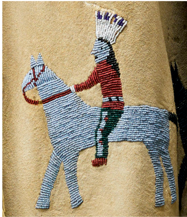
Figure 9. Regalia of Ithúŋkasaj Glešká (Detail of Figure 2a). Late nineteenth or early twentieth century. Buckskin and beadwork. Musée franco-américaine du château de Blérancourt.