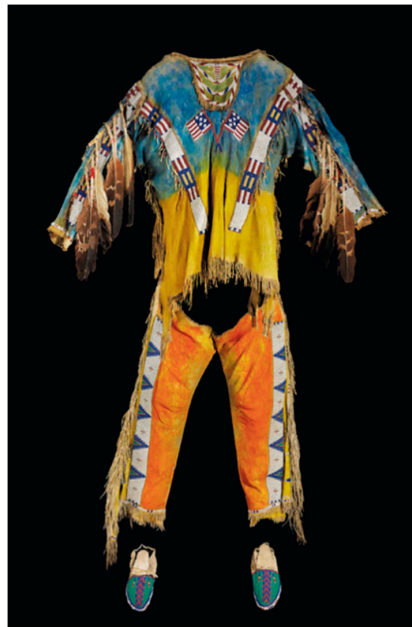
Figure 1. Plains Indian buckskin tunic and leggings, c. 1880s, beadwork, eagle feathers, paint, and quillwork on deerskin. Musée de l’Atelier Rosa-Bonheur, Château de By, Thomery, France.

in 1887 and in Paris in 1889 (Burns 2018b, pp. 31–35) (Figure 1). The other, made around the turn of the century, was worn by Ithúnkasaj Glešká (Spotted Weasel, c. 1852–c.1925–31), a Lakḥóta man who traveled with a group of Lakḥótas and Iroquois to live at the Jardin d’Acclimatation, a human zoo in the Bois de Boulogne, in 1911 (Figure 2) (Schneider 2011). Both sets of regalia are currently in French collections.