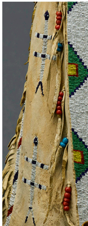
Figure 10. Regalia of Ithúŋkasaj Glešká (Detail of Figure 2a). Late nineteenth or early twentieth century. Buckskin and beadwork. Musée franco-américaine du château de Blérancourt.