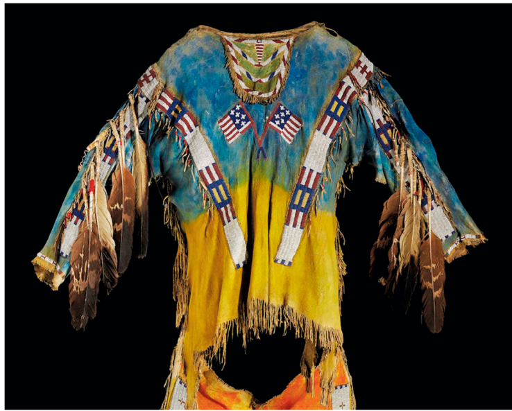
Figure 3. Plains Indian buckskin tunic (detail of Figure 1), c. 1888, beadwork, eagle feathers, paint, and quillwork on deerskin. Musée de l'Atelier Rosa-Bonheur, Château de By, Thomery, France.