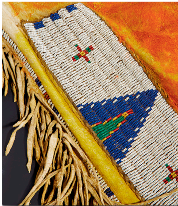
Figure 5. Detail of Plains Indian buckskin leggings (Figure 1), c. 1888, Musée de l'Atelier Rosa-Bonheur, Château de By, Thomery, France.