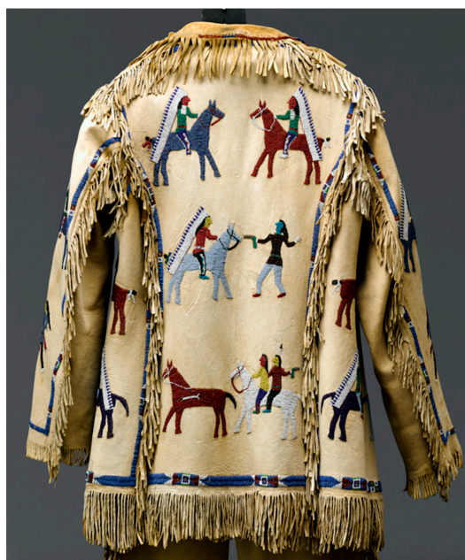
Figure 8. Regalia of Ithúnkasan Glešká. Detail of back (Figure 2b). Musée franco-américaine du château de Blérancourt.