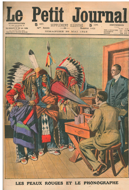
Figure 15. Cover of Le Petit Journal , “American Indians and the Phonograph” (“Les Peaux Rouges et le Phònographe”). 25 May 1913.

pp. 43–45, 49–54, 64–85). In their appropriations, both artists make presumptions of the regalia's rootedness in Lakŕhóta culture, yet it is the mobility of these objects, a trickster politics, that activated this transnational entanglement.