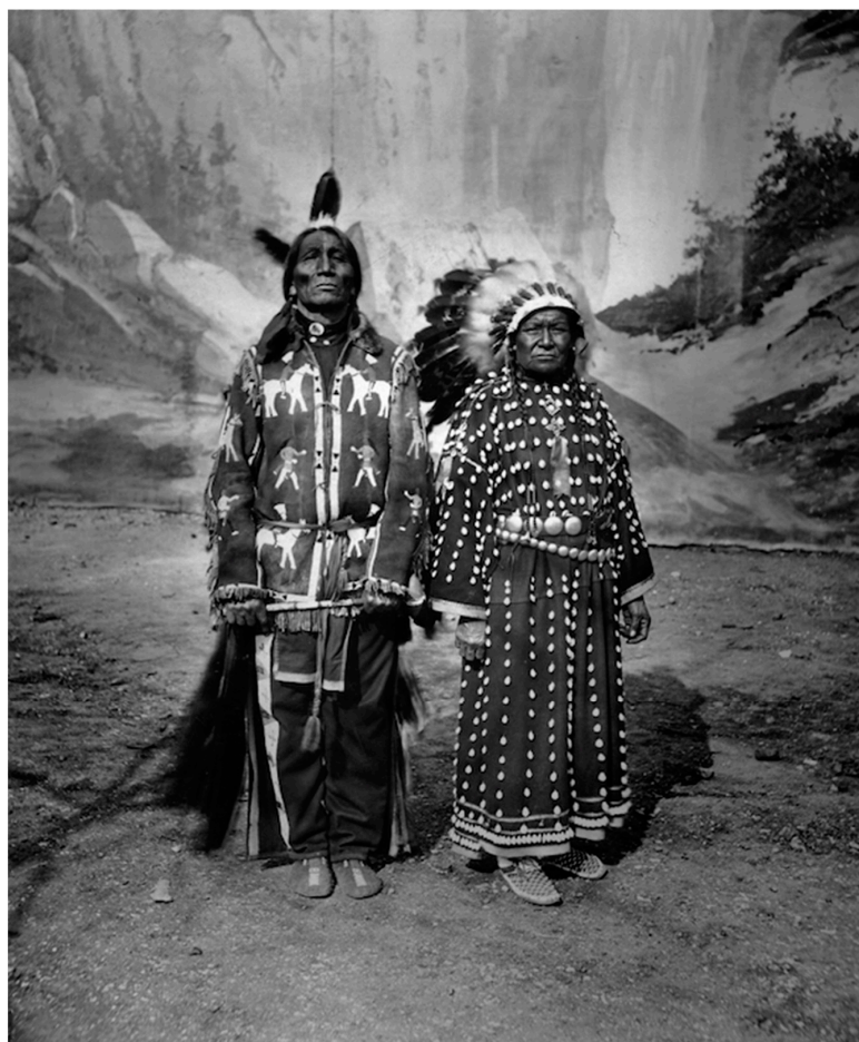
Figure 12. Ithúnkasany Glešká and Ĥanŋté Ithúnkasany Glešká in London, 1909, photographic print, 29 cm × 24 cm, Denver Public Library, X-32146.

The later piece of narrative beaded regalia was used by Ithúnkasany Glešká, a celebrity Lakǵóta performer in the early twentieth century. He was an irregular traveler with Buffalo Bill’s Wild West beginning in 1895 ( Burns 2018b , pp. 45–47), but participated regularly in European tours of other American Indian groups. In the years before World War I, he joined performance tours in London, Brussels, and Hamburg. His mobility is anticipated by the mobility of the figures within the beaded imagery on his jacket. He wears the regalia in photographs and postcards from London in 1909, alongside his wife Ĥanŋté Ithúnkasany Glešká (Cedar Spotted Weasel, 1851–ca. 1934) (Figure 12) and at the Jardin d’Acclimatation in Paris in 1911 (Figure 13), where he appears at far left in a postcard inaccurately projecting every individual as a “chief.” In both images, the garment appears oversized for him, his hands disappearing under the edges of the sleeves and the pants baggy. The misfit suggests that it may have been inherited in a giveaway or from another performer, evidence of the Lakǵóta practice of generosity within the community. Ithúnkasany Glešká vivifies a Lakǵóta warrior past, less through the shirt’s hybrid jacket model, and more through the circulation of the beaded narrative motif of the figures.