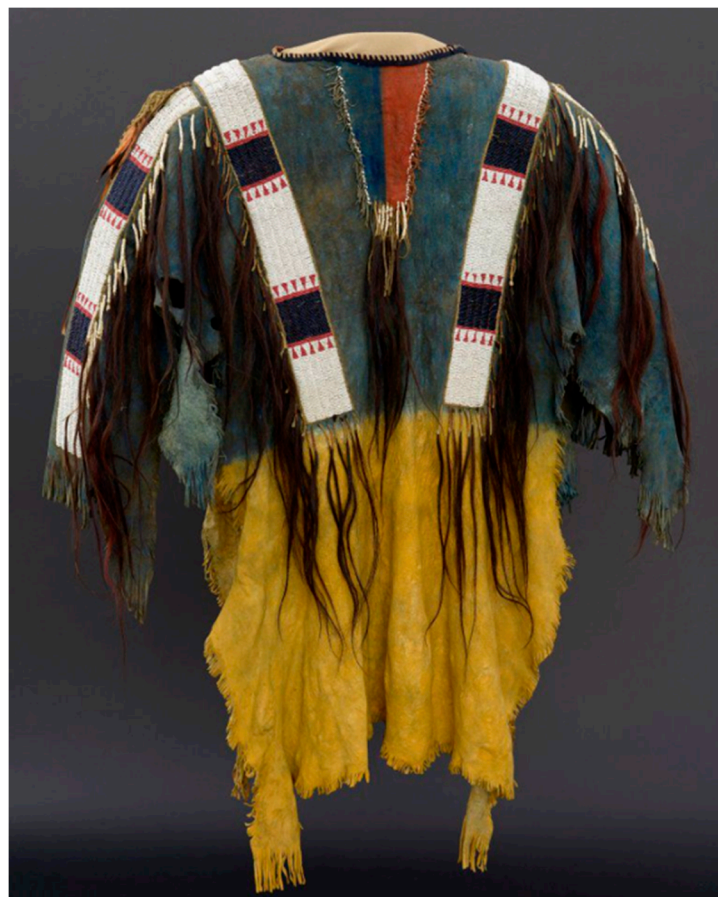
Figure 4. Oglála Lakshóta Shirt, c. 1868, tanned hide, wood cloth, pigments, glass beads, dyed porcupine quills, golden eagle feathers, northern flicker feathers, human hair, sinew, 97.79 cm × 48.26 cm. Plains Indian Museum, Buffalo Bill Center of the West, Cody, WY, Paul Dyck Collection, NA 202.1052.