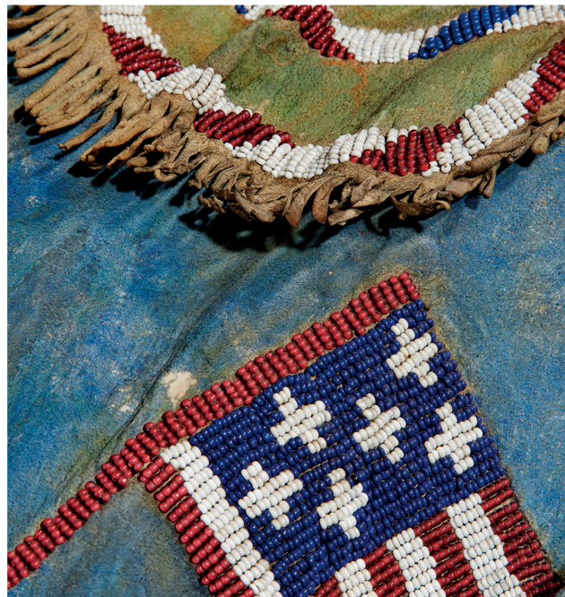
Figure 7. Detail of Plains Indian buckskin tunic (Figure 1), c. 1888, Musée de l'Atelier Rosa-Bonheur, Château de By, Thomery, France.