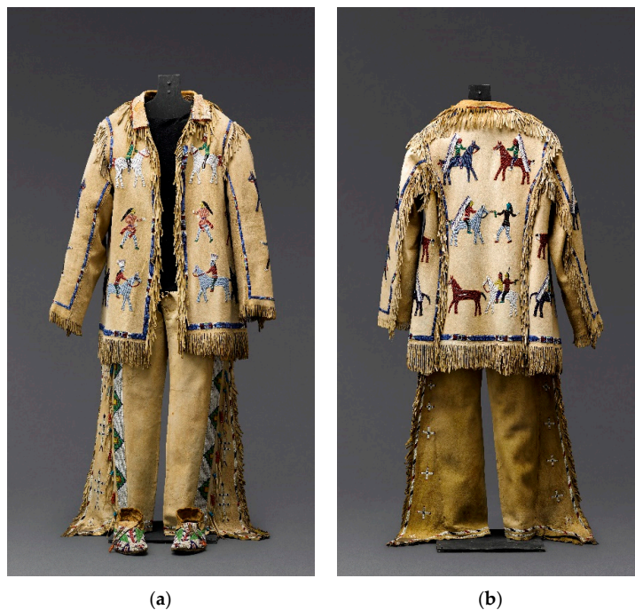
Figure 2. Regalia of Ithúnkasaj Glešká. (a) front of jacket, pants, and moccasins, (b) back of jacket and pants. Late nineteenth or early twentieth century. Buckskin and beadwork. Musée franco-américaine du château de Blérancourt.