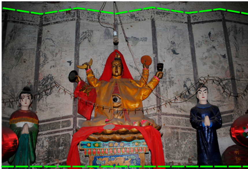
Figure 4. A folding screen painted on the back wall of the west wing of Xuanwu Temple in Xilimen Village, Hexi Town (No. 67 in Figure 1).