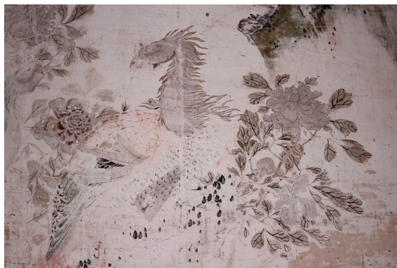
Figure 9. An ink-and-wash seated screen in the East Temple in the Dongjinzhai Village, Shimo Town (No. 36 in Figure 1).

The painters of the Gaoping temple frescoes varied in their painting skills. While the high-quality paintings are comparable to court-style or un-outlined ink-and-wash paintings, the low-quality paintings betray underdeveloped skills and hasty work, reflecting a kind of casualness often characteristic of works done by folk painters. Nevertheless, the very lack of deliberate elaboration, a trait observed of these frescoes in general, leaves these paintings with the artistic merit of excelling in natural beauty, which is an aesthetic ideal in traditional Chinese art. As exemplified by lotus flowers in one Chinese poem: growing out of clear water and rid of any decoration, the lotus flower stuns with its natural form (Peng 1986, p. 400). Such rough-hewn beauty displayed by the fresco paintings, resembling that achieved on Xuan paper, a kind of rice paper traditionally used in Chinese art, further demonstrates the impact of literati paintings that were widely practiced during Ming and Qing Dynasties (Figure 9).