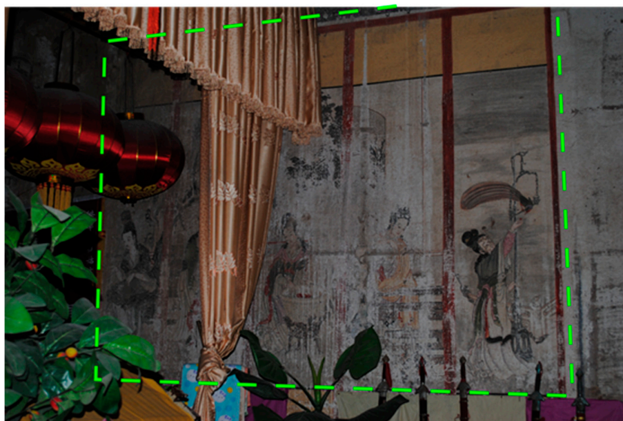
Figure 3. Hanging screen depicting ladys in the Xianggu Temple in Shangdongfeng Village (No. 51 in Figure 1).