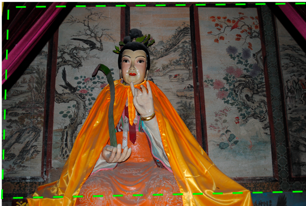
Figure 8. A folding screen depicting human figures, mountains and rivers, and flower and bird in the Yandi Temple in Jiaohu Village, Hexi Town (No. 60 in Figure 1).

In terms of the subject matter, these screen-style frescoes abandoned the traditional Buddhist and Daoist religious themes, and embraced secular subject matter characterized by imagery intended to convey meaning, and meaning intended to be of good fortune . By adopting a wide range of secular symbolisms, metaphors, and puns, these frescoes present the viewer with lively, bright, and beloved pictures representing secular life and folk traditions. Their subject matter includes three main categories. The first category focuses on portrait painting, featuring people with different occupations (the fisherman, the woodcutter, the farmer, and the scholar), literati in gatherings, and mythological characters. The second category is flower-and-bird paintings, which feature the 'Three Friends of Winter' (the pine, bamboo, and plum) and flowers from the four seasons. In this category, auspicious patterns are also often seen, such as two magpies perched on a plum tree and bamboo branches, or a couple of mandarin ducks swimming around lotus flowers, or a phoenix bird playing among peony flowers, and egrets alighted on lotus flowers. Last but not the least, mountains and water paintings often feature landscapes from the four seasons and hermits dwelling among mountains and rivers (Figure 8).