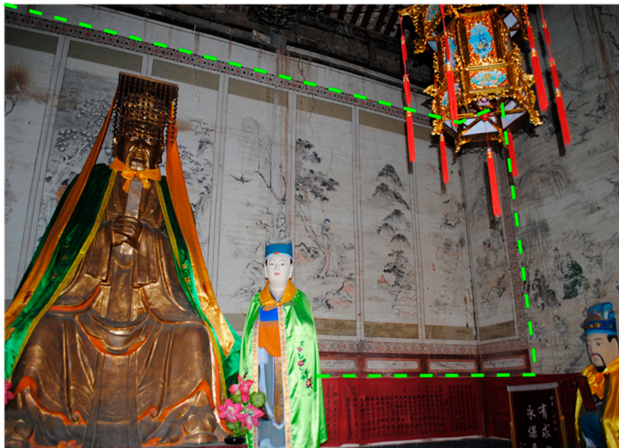
Figure 2. Part of 12-panel folding screen, within the green dashed lines, in the Guandi Temple in Ducun Village, Hexi Town (No. 64 in Figure 1).

The position of the walls often determines the types of screens painted on their surfaces. While the seated screen often appears on side walls, the folding screen and the hanging screen tend to show up on the back wall of the temple halls. To be more specific, the folding screen shaped like a staple is painted on the back wall, along with one to two panels on each of the side walls (Figure 2). The hanging screen, shaped as a straight line, is found on either the back wall or in an equal number of panels on each of the two side walls (Figure 3). The folding screen is frequently found on the back wall in the shape of a wave (Figure 4). The seated screen is usually painted on either the back wall or the side walls (Figure 5).