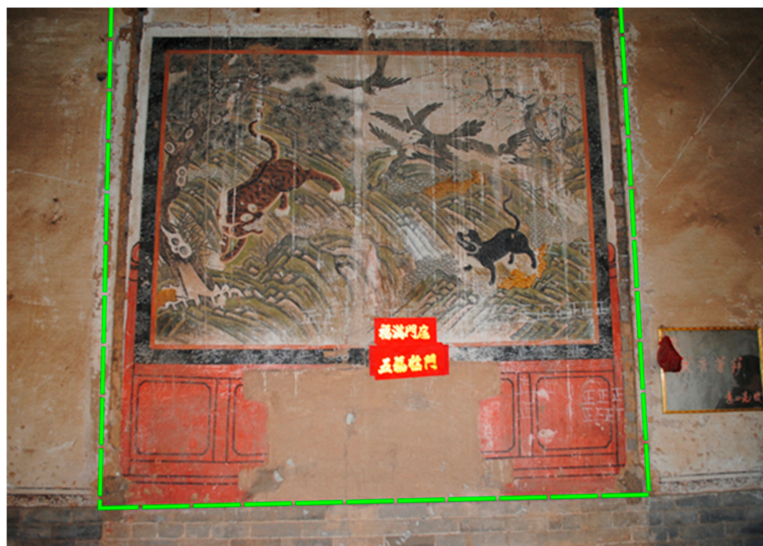
Figure 5. A single-panel seated screen in the Guandi Temple in Hedong Village, Mishan Town (No. 84 in Figure 1).

The screen-style frescoes account for 57.8% of all the mural paintings discovered in Gaoping so far. This ratio is between screen-style frescoes and all frescoes discovered so far. As the ineligible screen-style frescoes are not counted, screen-style frescoes actually account for a larger percentage of all frescoes. They represent almost all of the styles of real screens originating from that historical period, including the seated screen, folding screen, and hanging screen. The number of screen panels among the various works are 1, 4, 6, 8, 10, 12, 14, and 16. Of all the screen-style frescoes, the largest group consists of the 12-panel folding screens, while the second largest group comprises even-numbered-panel folding and hanging screens. The number of seated screens is relatively small.