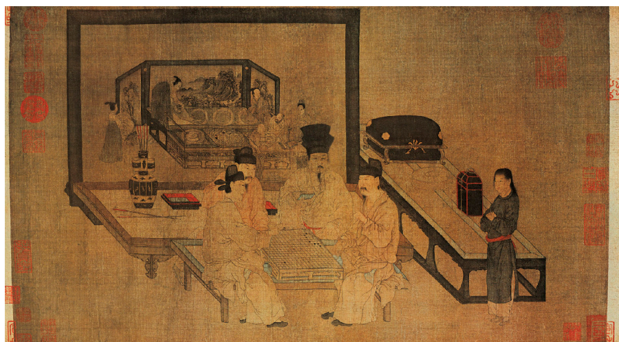
Figure 6. Zhou Wenju (Five Dynasties) Playing Chess beside Double Screen . Ink and colors on silk. (70.5 × 40.3 cm) Palace Museum Collection, Beijing.

The screen-style frescoes in Gaoping temples focus on the screen as their depicted object. The screen, besides being a piece of furniture, is itself a medium of painting by providing the painter with an ideal surface. Moreover, the screen has also served as a subject of painting, and is in fact among the most popular images presented in paintings since the beginning of the Chinese art history. In traditional Chinese paintings that incorporate the screen as part of the picture, artists not only vary the screen styles in accordance with the specific spatial environment in which their characters are found, but also take the depicted screen itself as an important painting surface by portraying subjects that fit in with the whole picture. A large quantity of Chinese paintings featuring the screen that came from almost every dynasty have survived (Liu 2011) (Figures 6 and 7). In addition to its physical functionality, the screen in such paintings constitutes both a medium of painting and an object of representation. The image of the screen featured in the screen-style frescoes in Gaoping temples serves the dual purpose of being both the object and medium of painting as well.