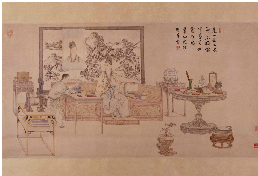
Figure 7. Ding Guanpeng (Qing Dynasty). Emperor Qianlong Appreciating Antiques in front of His Own Portrait . Ink and colors on silk. (76.5 × 147.2 cm). Palace Museum Collection, Beijing.