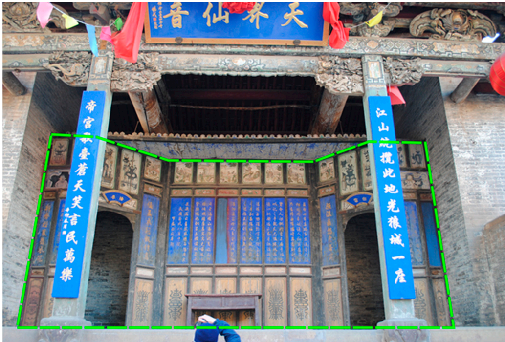
Figure 11. A screen relic in the backyard playhouse of the Chengtang Temple in the Kangying Village, Macun Town (No. 55 in Figure 1).