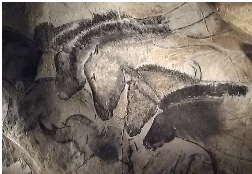
Figure 2. Group of Chauvet Cave Drawings. By Nachosan - Own work, CC BY-SA 3.0, https://commons.wikimedia.org/w/index.php?curid=32316562 .

In this context—and we rush here to our conclusion, and by way of returning to our central theme—the status of the graphic arts is given a powerful boost by the fact that so distinct is the emergence, and so invariant over time the performance and reception of certain of its styles, that we are entitled to regard it as a phenomenon —a phenomenon as yet imperfectly understood, but no less worthy of study, and potentially no less rewarding, than the phenomenon of a certain mineral ore able to fog unexposed photographic plates. Or in other words, we have here a near-ideal venue for interaction between the humanities and the sciences in respect to the question of a humane machine intelligence; and in support of this claim we exhibit following a group of drawings from the Chauvet Cave created some 32,000 years ago (Figure 2)—and the freshness and clarity and sensitivity of which must instill in us a deep wonder: