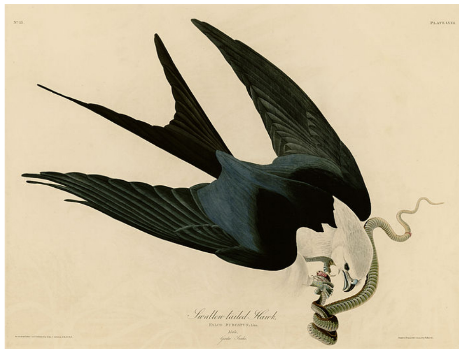
Figure 3. Swallow-tailed Kite by John James Audubon.

A computational analysis of the exquisite lines thereof (refined, as we must note, by the master engraver Havell) would almost certainly reveal, from a human factors standpoint, some noteworthy, if not indeed uncanny, qualities; but what should strike us as most uncanny is the fact that the collected set of such images—the graphic art created by Audubon under humble circumstances as he trekked through the wilds of North America—has been responsible for an outpouring of public commitment to environmental preservation to which no modern public relations campaign can bear comparison; i.e., we have here an example of the fact that art has a very real and unique power, and a greater appreciation and understanding of which has now become a vital matter.