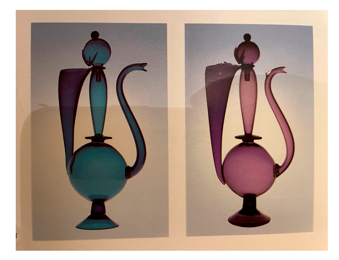
Figure 6. Aquaioloa. Credits: Attilio/Luigi Costantini (Licht and Lader 1990, p. 158).

fairy tale on account of an occidental tradition of storytelling. Different from these but yet characterised by a fabled poetry are his vessels that conjure up notions of The Book of One Thousand and One Nights (The Arabian Nights) with Aladdin and his magic lamp being the main point of reference for the orientalising forms (Figure 6).