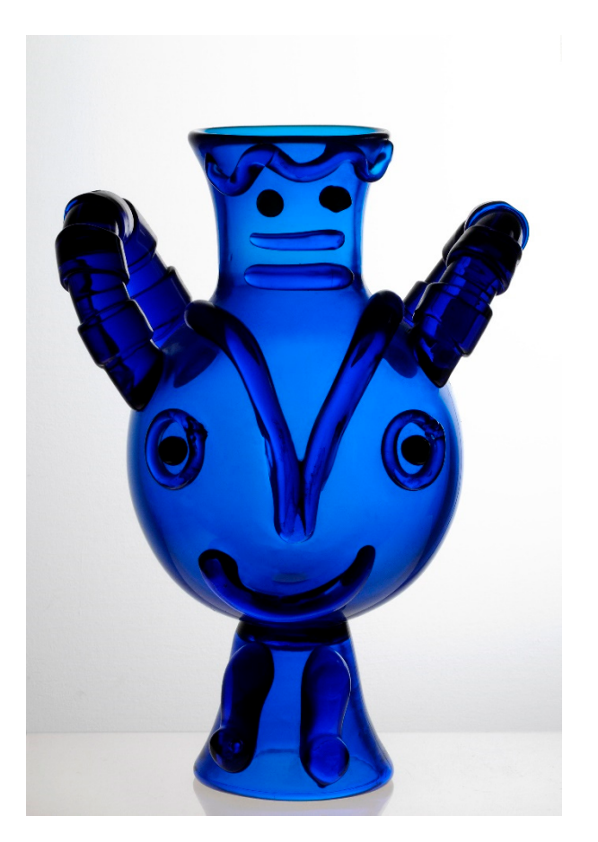
Figure 3. Anfora (1962).

Whilst Picasso could freely work most materials, the realisation of his blown glass sculptures required the involvement of a 'maestro vetraio', the so-called master glassmaker, thus resulting in a distancing between artwork and artist conditioned by the nature of the medium. A predicament that may however be overcome by reverting to the process of glass casting, an ancient technique which in modern times has witnessed a revival. However, as a form of potentially mechanical reproduction, it bears the risk of negatively impacting on the work's aura in the Benjaminian sense since the one-off piece is readily turned into multiples. Picasso's glass sculptures executed in both techniques accordingly lend themselves to a comparative approach that allows for a juxtaposition of artistic-manual procedures and their influence on the artist's respective iconography.