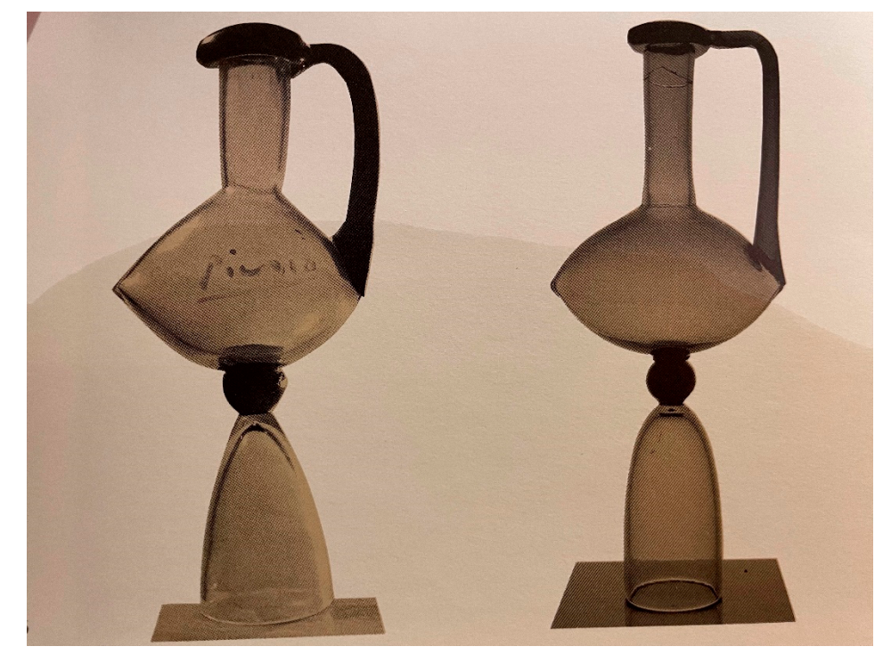
Figure 5. Picasso signing the Anfora Preciosa with lipstick. Credits: Attilio/Luigi Costantini (Licht and Lader 1990, p. 36).

for the first time, wished to sign it. Given the nature of the material and thus the inherent impossibility of doing so, he asked his wife Jacqueline for her lipstick with which he swiftly put his name on the sculpture (Rizzi 1986). Moreover, than illustrate Picasso's newly sparked passion for the medium the anecdotal account underlines one of the caveats glass comes with for artists. Its very caprice demands specific ways of handling, thus effectively conditioning the approach to it and marking it as radically different from other materials Picasso was accustomed to working in.