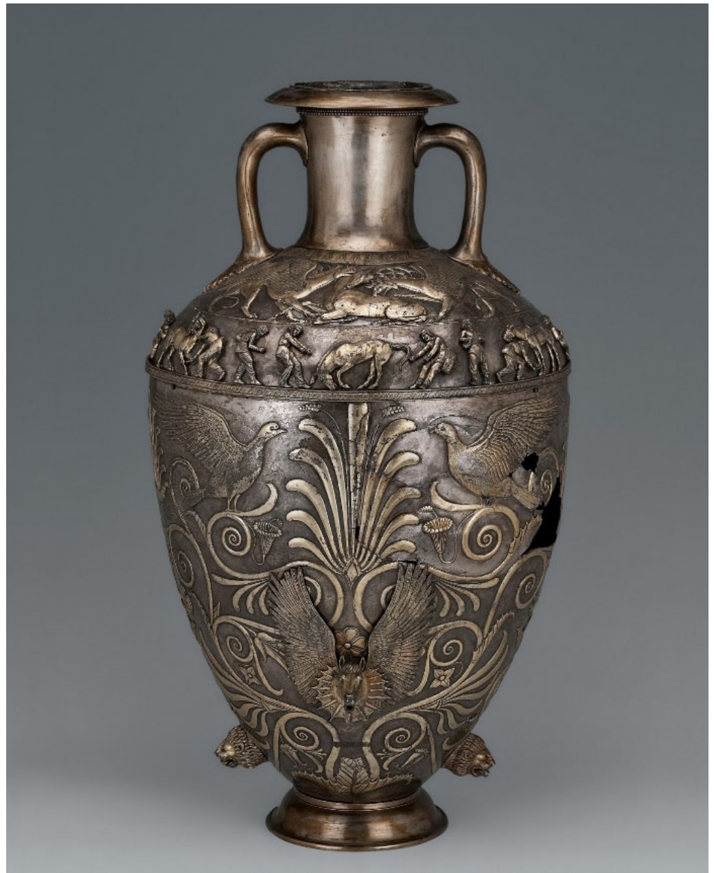
Figure 31. Amphora (SHM inv. no. ДН.1863-1/166); cast, embossed, chased, engraved, and gilded silver; Chertomlyk kurgan, Dnepropetrovsk region, Ukraine; 350–325 BC.

In the bottom panel above the shoulder, a scene of Scythian life, and not warfare, is depicted with Hellenistic naturalism. It shows Scythian men engaged in the capture, breaking and training of horses, activities that, considering the central place of the horse in Scythian nomadic pastoralist life as well as warfare, must have been a regular part of their lives. The central scene shows three Scythian men, one with a gorytos, lassoing an unbridled horse, which is straining against the tethers. There may well have been separately attached wires at one point to resemble the rope (Farkas 1977, p. 126). Left of this two Scythians, one again with a gorytos, are engaged in training a horse, bridled but not saddled, with one of the men holding the reins and the knee of the horse's raised leg. This horse pulls its head tightly away but is not moving as dramatically as the central horse. To the right of centre two men look on while another binds or perhaps releases