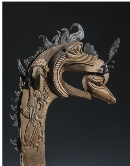
Figure 13. Finial in the form of a griffin holding a stag's head in its beak (SHM inv. no. 1684-170); cedar wood and leather; Kurgan 2, Pazyryk, Altai mountains, Russia; 5th century BC. [Image is used from www.hermitagemuseum.org (accessed 9 November 2022), courtesy of the State Hermitage Museum, St. Petersburg, Russia].