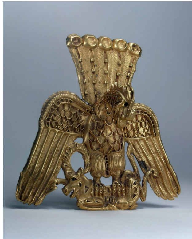
Figure 10. Gold headdress ornament (aigrette) with a fantastical eagle predating on an ibex (SHM inv. no. Сп.1727-1/131); gold with turquoise inlays; Siberian Collection of Peter I; 4th to 3rd century BC.

For the perspectivist, personhood is a subjective condition, an experience shared by all creatures. To every creature some of their prey appear as deer, while some of their predators are seen as tigers. The bodily effects of every creature appear subjectively depending on the perspective of the perceiver, that is, their position within the predator-prey food chain. These bodies and forms, of ungulate prey and feline predators, are the universal appearances of all prey to their predators and all predators to their prey, universal forms of prey-hood and predator-hood. When an animal body is represented, it has more meaning to the perspectivist than the simple creature depicted but represents an archetypal form of predator or prey that is embodied, from certain perspectives, by all creatures. Thus, these images of predator and prey animals in Scythian art may represent more than the specific animals they describe (as previous interpretations of them as supernatural beings have also suggested), rather they convey the forms of archetypal ungulate prey and feline predators.