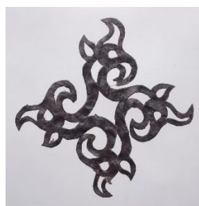
Figure 16. Applique in the form of four griffins' heads (SHM inv. no. 2179-903); leather; Kurgan 1, Tuekta, Altai mountains, Russia; 6th century BC.