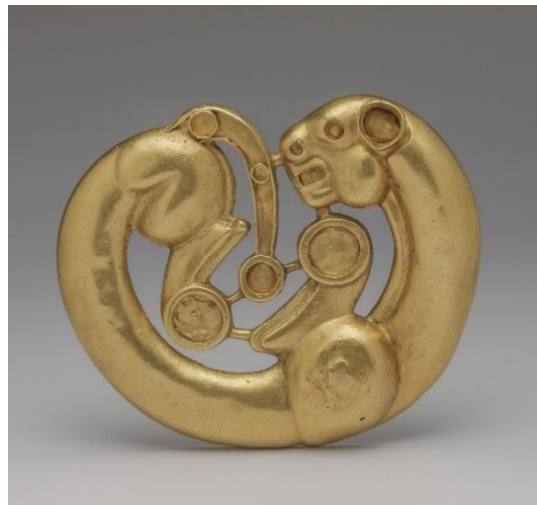
Figure 7. Plaque in the form of a coiled feline (SHM inv. no. Си.1727-1/88); chased gold; Siberian Collection of Peter I; 7th to 6th century BC.