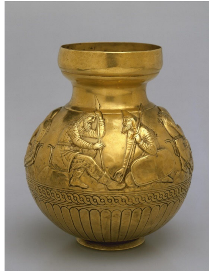
Figure 24. Vessel depicting Scythians (SHM inv. no. KO 11); gold; Kul' Oba, near Kerch, Crimea; late 4th century BC. [Image is used from www.hermitagemuseum.org (accessed 9 November 2022), courtesy of the State Hermitage Museum, St. Petersburg, Russia].

clothing is a mixture of the distinctly Greek and Scythian. The Solokha kurgan contains other very fine items of Greek craftsmanship, including a lion hunt bowl [Figure 26] that similarly combines the Scythian interest in scenes of contest with Greek artistic priorities, showing Scythians engaged in a classically inspired hunting scene. 51 In this contest humans, with their horses and dogs, are cast in the predatory role, taking on a lion, a much more classical or Near Eastern animal unfamiliar to most steppe nomads.