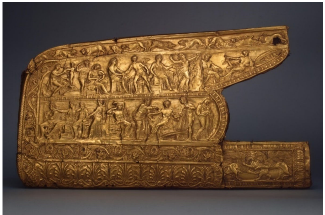
Figure 30. Gorytos cover (SHM inv. no. Дн.1863-1/435); gold; Chertomlyk kurgan, Dnepropetrovsk region, Ukraine; 350–325 BC. [Image is used from www.hermitagemuseum.org (accessed 9 November 2022), courtesy of the State Hermitage Museum, St. Petersburg, Russia].

Comparable to the Chertomlyk [Figure 30] and Solokha gorytos is the gorytos from Vergina tomb II, often identified as belonging to Philip II of Macedon, in the Central Macedonia region in present-day Greece. 60 The layout of this gorytos' panels is similar. In the central panel a furious battle rages between various classical nude Greek warriors, perhaps another Trojan scene. The upper border is filled with a line of geese or swans, while the wing tab contains a mythic-warrior, perhaps Apollo or a hero. While these gorytos are all of fine Greek manufacture, the gorytos as a piece of war gear is Scythian in origin, and in Vergina this gorytos likely represents an exotic gift to a Macedonian ruler from a Scythian or Bosphoran ruler. Thus, intended for a non-Scythian audience, it has been stripped of any animal style imagery. The geese or swans are a simple repeating pattern, while the tab is given over to an anthropomorphic figure. However, it does perhaps serve to confirm a rule in the layout of these gorytos, all of which are of the same design, that the spaces around the main scene are laid aside for the depiction of scenes other than human narratives.