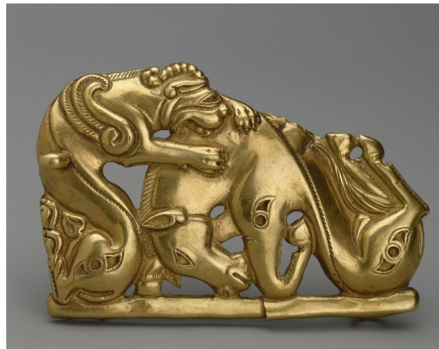
Figure 32. Belt plaque (left) with scene of animal combat (SHM inv. no. Сп.1727-1/6); cast and chased gold; Siberian Collection of Peter I; c. 4th to 3rd century BC.

animal style. For instance, a gold belt plaque [Figure 32] from Peter the Great's collection serves as a direct comparison of a composite fantastic creature attacking a horse (and biting it on the neck) within a typical animal style scene. These perhaps depict wild equids like Tarpan, Przewalski's horse, Kiang, and Onager. On the pectoral too, like other Hellenistic renditions of the Scythian animal style [Figures 26 and 28–31], the animals are all of a more Greek or Near Eastern rather than Scythian variety, so there is little incongruous about the presence of horses. In this object we see more animals than horses represented in the same space of human naturalism, but like horses they are animals that pervaded Scythian life and yet are curiously absent from their own art, while they are also part of the domestic sphere. In his essay on perspectivism among the pastoralists of the modern Altai, Ludek Broz has proposed that, in contrast to Amerindian perspectivism which distinguishes fundamentally between the human person and the animal other, in Altaic perspectivism the division of the domestic and wild is key (Broz 2007). It could very well have been the same for the pastoralist Scythians of the Altai and Pontic steppes.