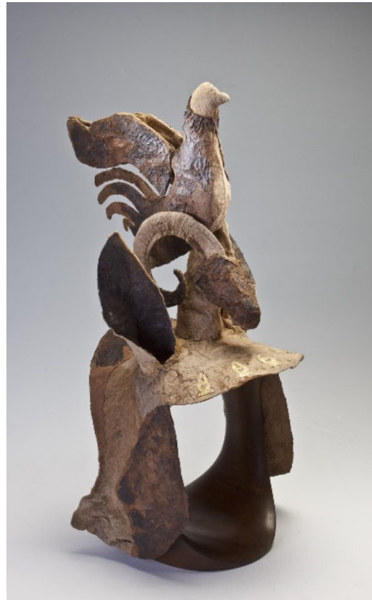
Figure 2. Horse headgear (SHM inv. no. 1684/414); felt, leather, wood, gold foil; Kurgan 2, Pazyryk, Altai mountains, Russia; late 4th to early 3rd century BC.

here. Humans and domestic animals only really appear in artworks directly influenced by more naturalistic settled, particularly Greek and Persian, styles, entirely distinct from the predominant stylised Scythian animal style. This makes the meanings inherent in Scythian iconography even harder to penetrate.