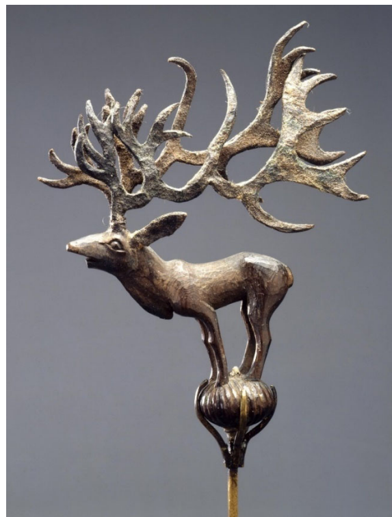
Figure 6. Pin finial in the form of a stag (SHM inv. no. 1684-154); leather, wood; Kurgan 2, Pazyryk, Altai mountains, Russia; late 4th to early 3rd century BC.

Coiled felines likewise strikingly recur, the suppleness of the cat captured in the stylised circle wherein its muzzle touches its tail. The 7th–6th century gold plaque from Peter the Great's Siberian collection [Figure 7] is a prominent example, with miniature versions of this discovered in the Shilitki kurgans in the Tarbagatai mountains, while examples also exist from the Pontic steppe [Figure 8], all formed into shapes approaching circles. 21