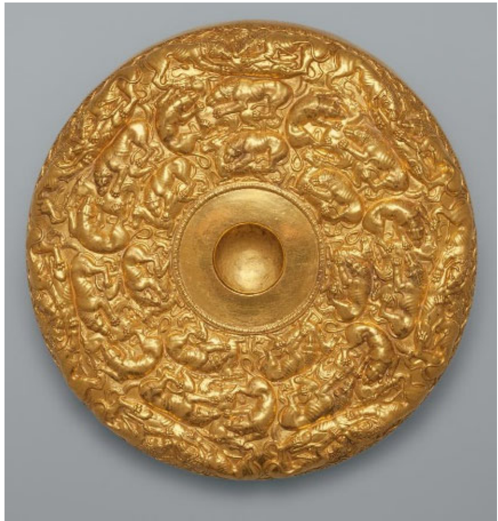
Figure 28. Phiale depicting contest between beasts (SHM inv. no. ДН.1913-1/48); chased gold; Solokha Tumulus, Dnepropetrovsk region, Ukraine; late 5th to early 4th century BC.