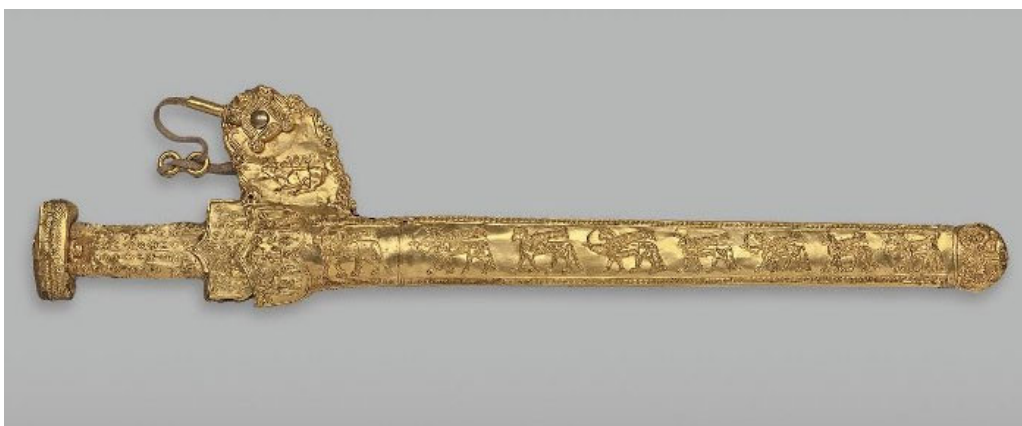
Figure 22. Akinakes in Sheath with a stamped ornament . 7th century BC. Gold, iron. 47 × 14.1 cm (sheath); 15.5 × 7 cm (handle). SHM Inv.no. Ky.1903-2/2..