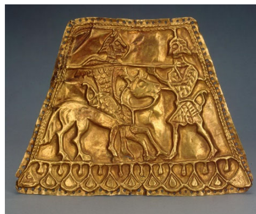
Figure 27. Gold plaque depicting a battle (SHM inv. no. ДН.1859-1/2); gold; Geremesov Khutor, Dnieper area, Ukraine; 4th century BC.

Most of these items seem to have been made by Greek craftsmen, or at least by metalworkers intimately acquainted with and highly skilled in Greek artistic and manufacturing techniques. Stylistically and in the technical quality of their manufacture they are quite unlike most other Scythian art and resemble the finest Greek work, and if not explicitly concerned with classical subjects, they all show the influence of classical styles. They also come from sites close to Greek settlements or with clear connections to such settlements and the craftsmen could well be drawing on observation of the Scythians in and around these settlements, creating representations of Scythian life comparable to that of Herodotus. Other items from these burials are clearly made by Scythian craftsmen influenced by Greek styles. A plaque from Geremesov [Figure 27], in the Dnieper basin, shows a similar scene to the Solokha comb in a much cruder style, depicting in flat side-on profile a battle between a mounted and dismounted Scythian warrior. 52 The depiction of a human scene suggests Greek influence, while the details of the subject itself confirm that the people among whom it was made experienced and were influenced by Greek contact. The warriors, as well as wearing scale mail and carrying gorytos, both wear Greek Corinthian or Chalcidian helmets like the rider from the Solokha comb [Figure 25].