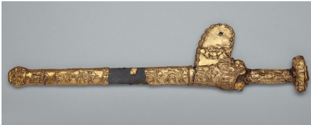
Figure 23. Sword with decorated scabbard (SHM inv. no. ДН.1763-1/19); cast and forged iron, chased gold; Melgunov (Litoi), Dnieper area, Ukraine; c. 7th century BC.