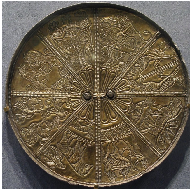
Figure 21. Silver mirror (SHM inv. no. Ky.1904-1/27); silver; Kelermes, Kuban region, Russia; c. 7th century BC.

by composite creatures with the bodies of bulls or lions, the heads of lions or humans, and wings in the shape of fish, all wielding bows with human arms. At the same time the tabs, from which the sword would have hung from a belt, are both emblazoned with a recumbent deer of a strikingly Scythian style (finding an incredibly direct parallel in [Figure 3]). While some items of Urartian style were probably gained as loot from frequent raiding south of the Caucasus, the items here described are clearly creations intended for a Scythian market, executed in the impressive style of a sedentary kingdom, while displaying Scythian iconographic priorities and input.