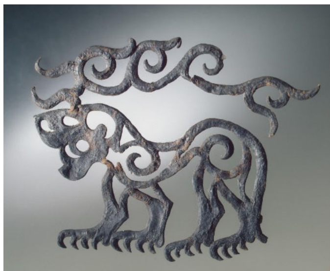
Figure 14. Applique of tiger with antlers (SHM inv. no. 2179-912); leather; Kurgan 1, Tuekta, Altai mountains, Russia; 6th century BC.