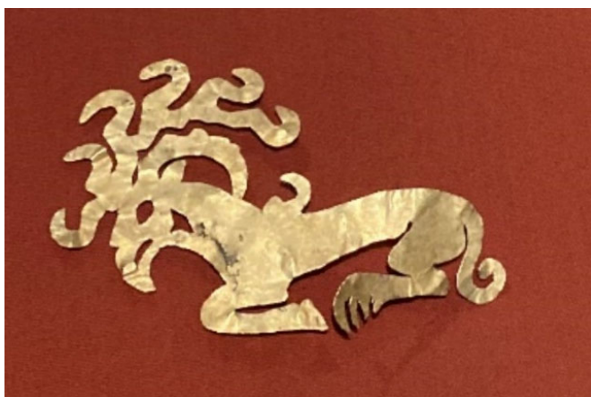
Figure 18. 'Hippogriff' (EKRM inv. no. КТЮ94-39409-39413); gold; Kurgan 7, Group IV, Eleke Sazy, Tarbagatai mountains, Kazakhstan; 5th to 4th century BC.