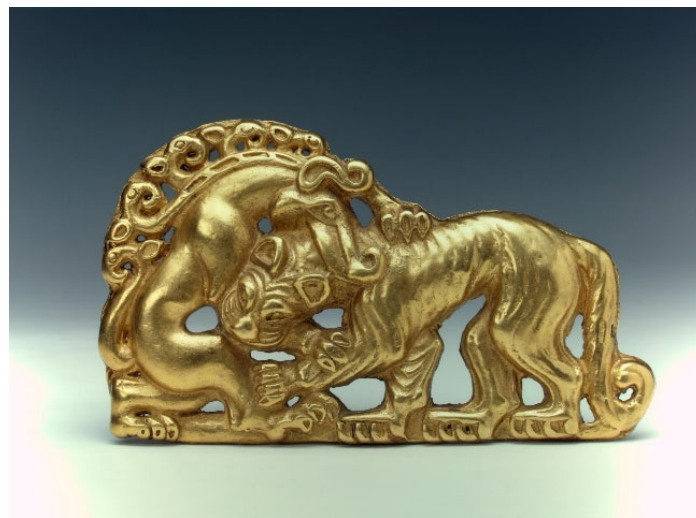
Figure 20. Belt buckle with a contest scene between a tiger and an underworld monster (SHM inv. no. Сп.1727-1/11); cast gold; Siberian Collection of Peter I; c. 4th to 3rd century BC.

A beast somewhat similar to the Tuekta tiger can be seen in an object from Peter the Great's collection [Figure 20], a belt buckle depicting "a predator from the underworld" fighting a tiger. 37 The beast clearly has the body of a predator, but its head, with its pointed ears, long muzzle and upturned nose, is less feline than lupine if it is even meant to resemble a real creature. It again sports antlers that extend down the length of its back and end in explicit birds' heads. Entangled in combat with a tiger, this is a contest between predators, although the monster is clearly the higher predator, standing partially upright and biting down on the tiger's neck. All these objects seem clear depictions of terrifying supernatural predators, preying even on predatory felines. When seen through the perspectivist lens, they might be seen to represent, however ambiguously or specifically, various forms of existential threat in the person of spirits. 38 These 'spirits' are not ethereal but earthy, stitched together from real predatory animals to form monstrous, terrible creatures engaging in the same kinds of contest as other predators, but whose predation is an even greater threat than that of the visible predators.