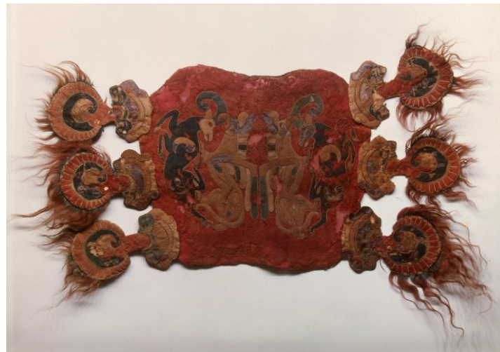
Figure 12. Saddle cover showing a griffin attacking a mountain sheep (SHM inv. no. 1295-150); felt and horsehair; Kurgan 1, Pazyryk, Altai mountains, Russia; late 4th to early 3rd century BC.

The Griffin is the most recurrent composite creature in Scythian art. Herodotus, in his description of the lands of the Scythians, tells a story about griffins that protected gold hoards far to the north-east (Hdt. 4.27), perhaps where the Greeks would have described the Urals. In Scythian art, griffins are frequently depicted attacking prey animals or in entangled combat with feline predators or other griffins. Three of the Pazyryk 1 saddle covers show griffins attacking Altai argali [Figure 12] and tigers (Argent 2010, pp. 166–67). The motif of the individual recumbent deer and the predating griffin is particularly widespread throughout Scythian art, from the Pazyryk burials [Figure 13] to the Pontic steppe (objects which we will examine in greater detail later). Despite being ubiquitous across Scythian art, their depiction very often seems to be influenced by Greek or Persian representations (although it is not entirely clear that this is a one-way influence). There is something of the dragon about the griffin in its combination of all man's primordial predators, the feline, raptor, and snake, the archetypal apex predator.