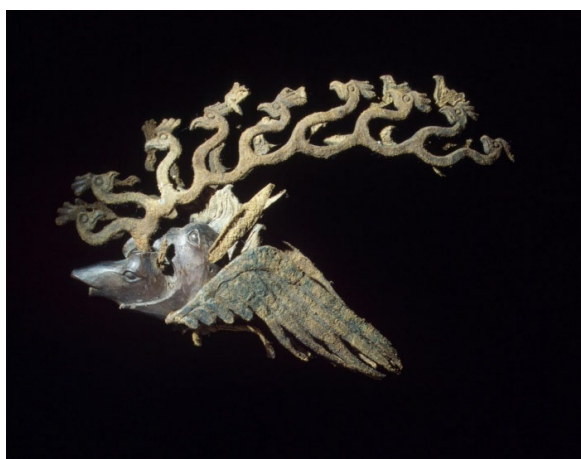
Figure 17. Finial in the form of a griffin holding a stag's head in its beak (SHM inv. no. 1684-169); cedar wood and leather; Kurgan 2, Pazyryk, Altai mountains, Russia; 5th century BC.