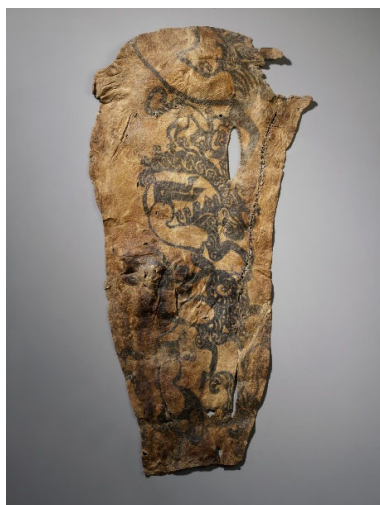
Figure 19. Tattoos on the right arm of a man (SHM inv. no. 1684-298); mummified skin; Kurgan 2, Pazyryk, Altai mountains, Russia; 5th century BC.