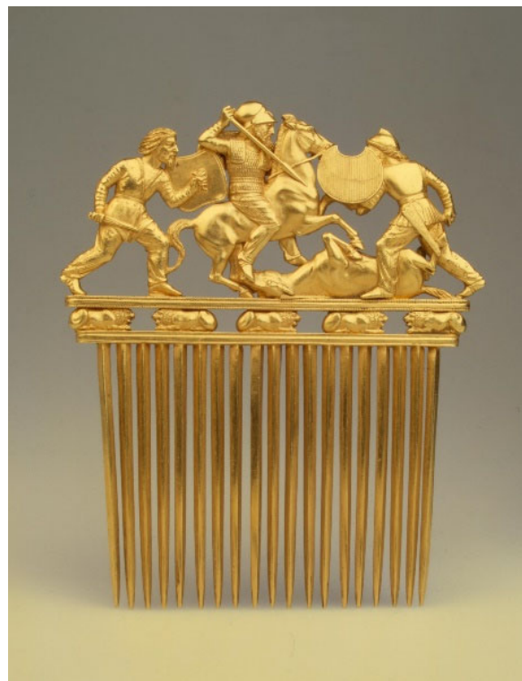
Figure 25. Comb with battle scene (SHM inv. no. ДН.1913-1/1); gold; Solokha Tumulus, Dnepropetrovsk region, Ukraine; late 5th to early 4th century BC. [Image is used from www.hermitagemuseum.org (accessed 9 November 2022), courtesy of the State Hermitage Museum, St. Petersburg, Russia].