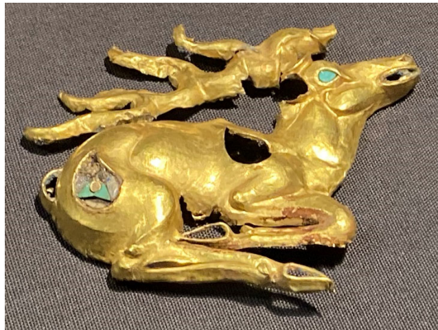
Figure 5. Recumbent stag plaque (EKRM inv. no. КΠΟ93-38625); gold with turquoise and lapis lazuli inlays; Kurgan 4, group II, Eleke Sazy, Tarbagatai mountains, Kazakhstan; 8th to 6th century BC.