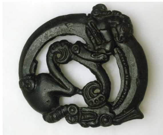
Figure 8. Bridle plaque in the form of a coiled feline (SHM inv. no. Кр.1895-10/2); cast bronze; Kulakovsky Tumulus 2, Crimean Peninsula; early 5th century BC.

It has often been suggested that the stylised, exaggerated, and unrealistic nature of such depictions indicate the other-worldly nature of the creatures depicted, for instance that oversized antlers denote the spiritual nature of these deer (Farkas 2000, p. 13). However, it seems perhaps more likely that the artisans are simply exaggerating the stag's most prominent features, derived from observation. Those features, their antlers and the unique movement of their muscles, which capture the essence of the animal's body and its key characteristics and are the most pleasing to recreate and turn into decoration, with the potential to be represented with a variety patterns and shapes. Far from obscuring the physical animals, the Scythian animal style accentuates the representation of specific animals.