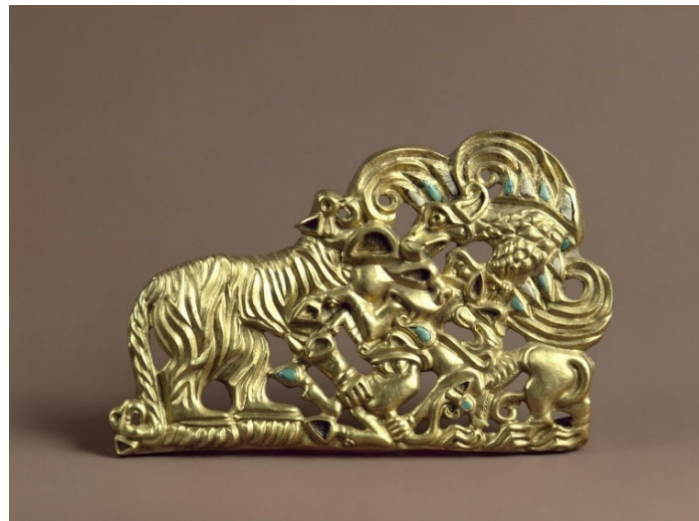
Figure 1. Belt plaque (right) with scenes of animal combat (SHM inv. no. Сп.1727-1/2); gold and turquoise; Siberian Collection of Peter I; c. 6th century BC.

in dynamic forms, often entangled in vigorous scenes of wild conflict. Nearly always, even when compiling fantastical composite predators, they are depicting, in whole or in part, the real animals and specific species which they observed around them. Some of the finest examples of Scythian animal style come from Peter the Great's Siberian collection, the first substantial collection of Scythian artefacts, assembled in the early 18th century. 8 These plaques and other body adornments made of cast gold display a lively animal style and many depict scenes of wild contest [Figure 1]; although some reveal the influence of Achaemenid Persian art. 9 However, despite the quality of these works, their usefulness in studying Scythian art is limited by their lack of context. Collected by treasure-hunters, having most likely been looted from kurgans, very little can be determined about their origins, although they are clearly Scythian. Mostly purchased for the Tsar's collection from locations in the Urals, these items probably originate from the Urals, from further south into Central Asia (some objects display stylistic similarities with the Achaemenid Oxus Treasure, from present-day Tajikistan) and from further east, perhaps as far as the Altai. 10