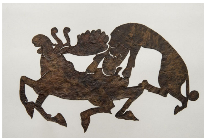
Figure 11. Saddle cover showing a feline attacking a moose (SHM inv. no. 1295-250); leather; Kurgan 1, Pazyryk, Altai mountains, Russia; late 4th to early 3rd century BC.