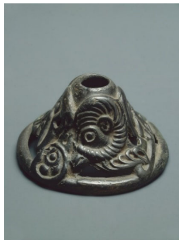
Figure 9. Bridle piece with rams clashing (SHM inv. no. 3975-343); cast bronze; Khakass-Minusinsk Basin, Krasnoyarsk Territory, Southern Siberia, Russia; Tagar culture, 5th century BC.