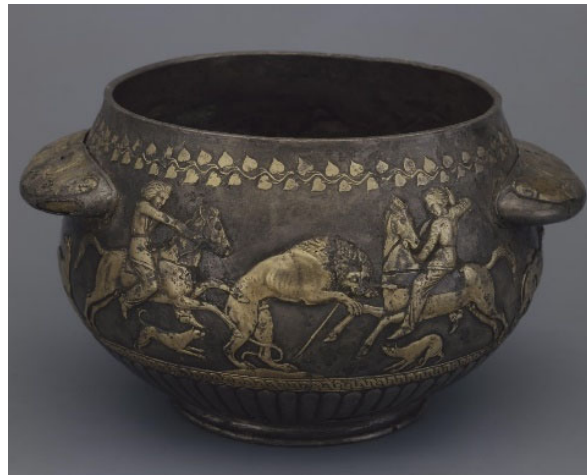
Figure 26. Vessel with lion hunting scenes (SHM inv. no. ДН.1913-1/40); silver and gilt silver; Kurgan 2, Solokha, Dnepropetrovsk region, Ukraine; early 4th century BC. [Image is used from www.hermitagemuseum.org (accessed 9 November 2022), courtesy of the State Hermitage Museum, St. Petersburg, Russia].

Most of these items seem to have been made by Greek craftsmen, or at least by metalworkers intimately acquainted with and highly skilled in Greek artistic and manufacturing techniques. Stylistically and in the technical quality of their manufacture they are quite unlike most other Scythian art and resemble the finest Greek work, and if not explicitly concerned with classical subjects, they all show the influence of classical styles. They also come from sites close to Greek settlements or with clear connections to such settlements and the craftsmen could well be drawing on observation of the Scythians in and around these settlements, creating representations of Scythian life comparable to that of Herodotus. Other items from these burials are clearly made by Scythian craftsmen influenced by Greek styles. A plaque from Geremesov [Figure 27], in the Dnieper basin, shows a similar scene to the Solokha comb in a much cruder style, depicting in flat side-on profile a battle between a mounted and dismounted Scythian warrior. 52 The depiction of a human scene suggests Greek influence, while the details of the subject itself confirm that the people among whom it was made experienced and were influenced by Greek contact. The warriors, as well as wearing scale mail and carrying gorytos, both wear Greek Corinthian or Chalcidian helmets like the rider from the Solokha comb [Figure 25].