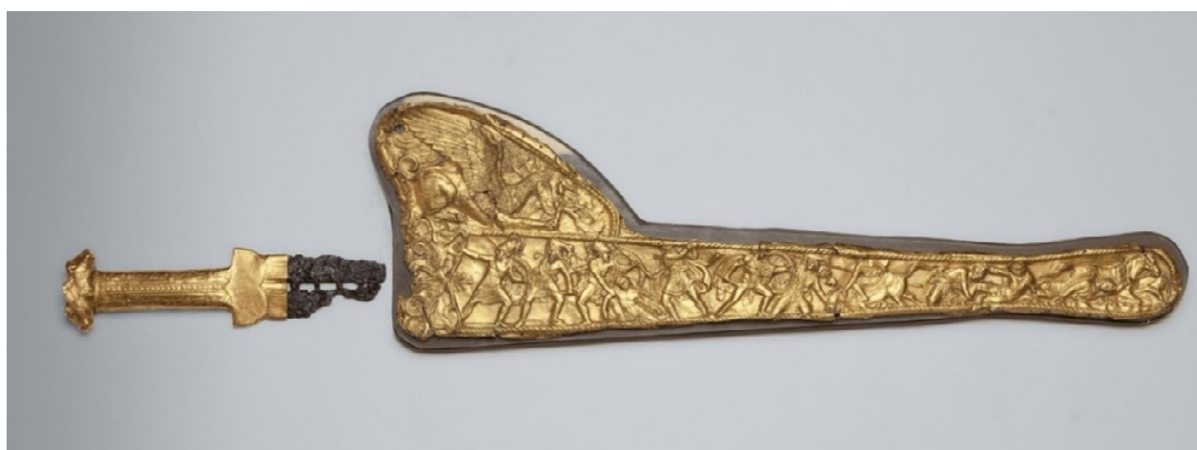
Figure 29. Decorated overlay for a scabbard (not including sword and handle) (SHM inv. no. ДН.1863-1/447); gold; Chertomlyk kurgan, Dnepropetrovsk region, Ukraine; 350–325 BC. [Image is used from www.hermitagemuseum.org (accessed 9 November 2022), courtesy of the State Hermitage Museum, St. Petersburg, Russia].

The Solokha gorytos, made of gilded silver and dating from the 4th century BC, in its main panel shows a similar classically inspired scene of battle between stereotypical ‘barbarian’ warriors, clearly intended to be Scythians, a more classical and less realistic version of the Solokha comb battle scene [Figure 25]. 57 Two of the warriors are mounted while three are on foot. The panel above this, on that side of the gorytos which the strung bow inside would have faced, there is a scene of a lion and a griffin attacking a fallow deer stag, all three of these of the Greek types discussed above, while in the panel on the right side tab, on the bow string side, two winged and horned felines attack each other. Again,