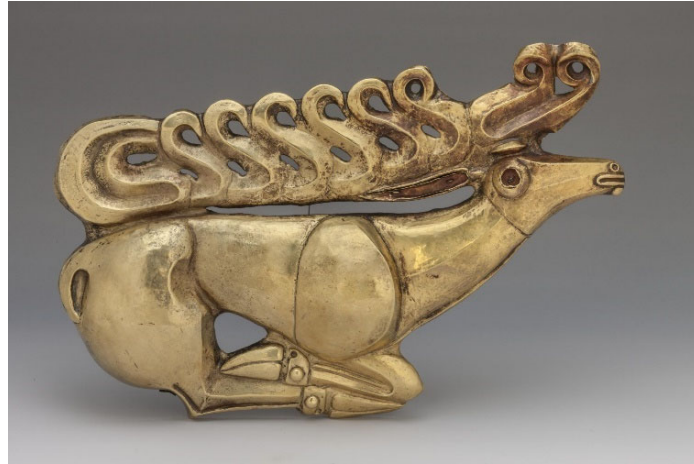
Figure 3. Shield plaque in the form of a deer (SHM inv. no. 2498-1); embossed and chased gold; Kurgan 1, Kostromskaya, Kuban region, Russia; second half of the 7th century BC.

themselves [Figure 6]. There are many other similar examples from the Kazakh steppe, the Pontic steppe, including the Crimean Peninsula and the Dnieper and Kuban River basins, and other areas across the Scythian range. 20