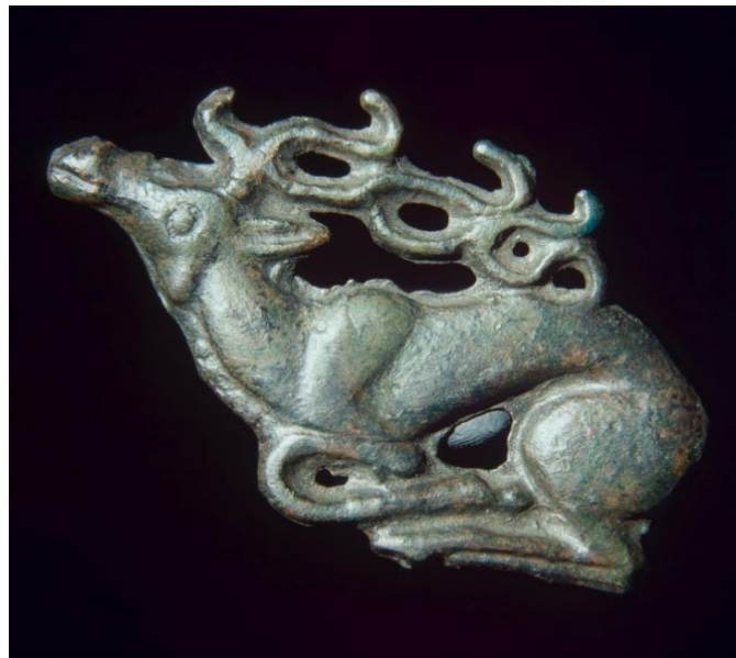
Figure 4. Plaque in the form of a stag (SHM inv. no. 1293-198); cast bronze; Maly Telek, Khakass-Minusinsk Basin, Krasnoyarsk Territory, Southern Siberia, Russia; Tagar culture, 7th to 6th century BC.