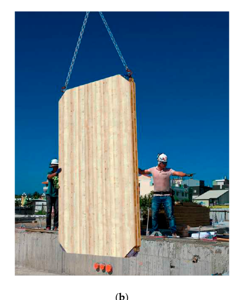
Figure 7. Panel lifting with (a) the conventional method [86] and (b) novel connectors (CLT-C2) [60].