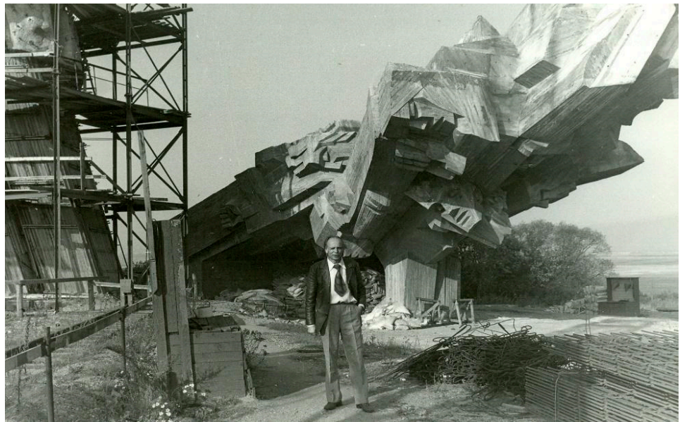
Figure 4. Architect V. Vielius during the process of the construction of the Ninth Fort monument in Kaunas, the late 1970s.