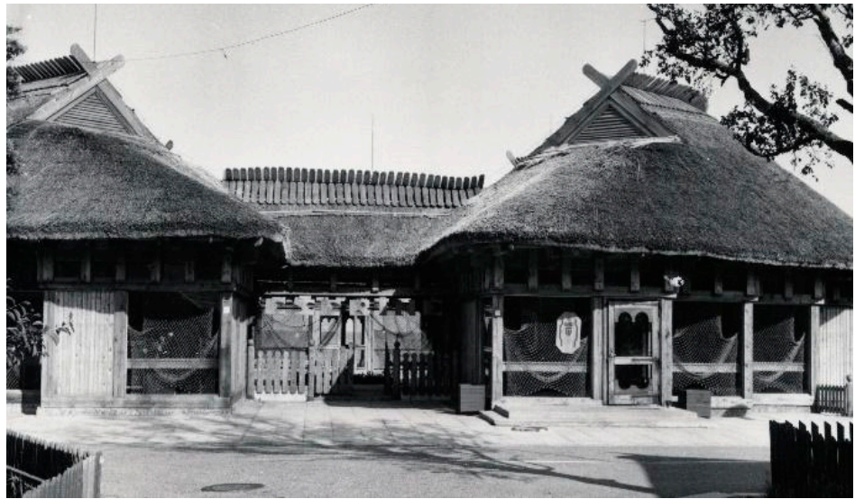
Figure 9. Restaurant “Ešerinė” in Nida, designed by Vaidotas Guogis, built in 1977.