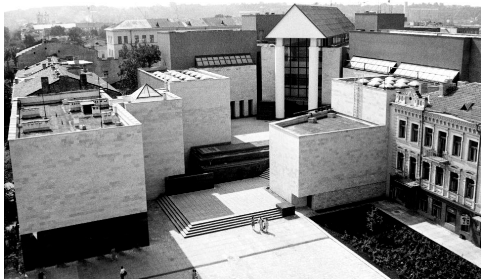
Figure 10. Mykolas Žilinskas Art Gallery in Kaunas, designed in 1981 by E. Miliūnas, K. Kisielius and S. Juškys, built in 1988.

Thus, instead of having a single image of Soviet architecture dominated by ideology, deeper case studies reveal that the cultural references encoded in the objects of this period are much more complex, combining within themselves the Soviet matrix, but at the same time, global thematic frameworks as well. The Soviet modernism in Lithuania can be hardly treated as sole result of global trends represented as themes or, a straightforward result of Soviet ideology, or just the collection of local cultural references. It is a multifaceted phenomenon. Several examples from different decades have shown that the value assessment should, in most cases, be organized as a construction of complex narratives. Furthermore, value should be debated not only from the perspective of the narrative represented at the time of construction, but also through the architectural meanings developed over time. In this way, the methodology can be based on deep historical research, which consciously seeks to evaluate the object in terms of global themes, but at the same time in terms of local cultural references.