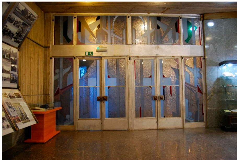
Figure 7. Standard aluminium doors in the memorial complex of the Ninth Fort in Kaunas.

One of the most convincing embodiments of the priority of economy and efficiency in Soviet construction is the so-called cascading structure of the social service. The aim of such an urban system was to construct the social infrastructure system, based on the principle of walkability. According to this principle, the urban territory must be divided into a network of districts and subdistricts, with each fragment being assigned for a certain number of predetermined service establishments, the size of which is characterised by various indicators per thousand inhabitants [55]. Such a system of typologies essentially