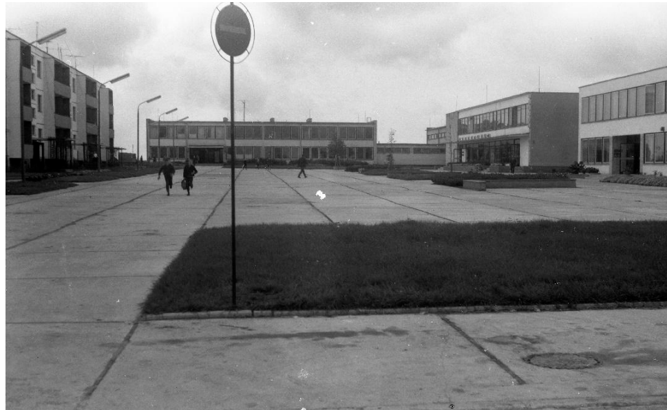
Figure 8. Community centre for Dainava settlement, 1970s.

corresponds to the modernist principles of effective urban planning and represents the theme of rapid urbanization (Theme 1). Following this universal logic, over several decades, Lithuanian cities have been infused with a network of mass housing, public services, and industrial enterprises (Figure 8). Although at the same time, their poor technical quality, clearly represents Soviet-ness, and thus, encourages a critical assessment of their possible value.