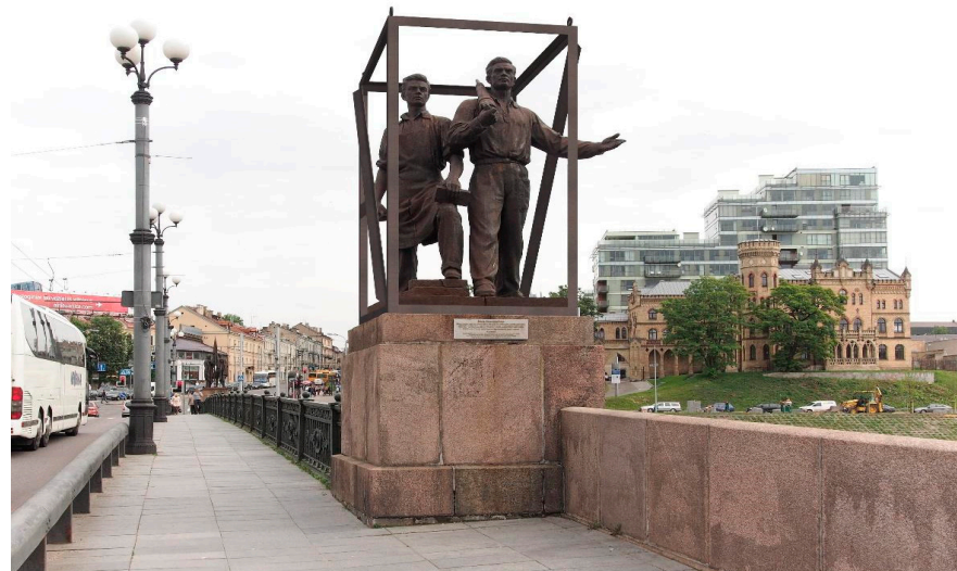
Figure 2. Symbolic imprisonment of Soviet sculptures in metal cages (designed by A. Ambrasas, 2014) on the Green bridge in Vilnius (architect V. Anikinas, 1948–1952).

In public discourse, the standard position towards the Soviet legacy mainly represents two ways of interpretation. Part of society accepts this heritage as an inseparable fragment of history, which, despite being Soviet, is also witness to Lithuanian history. According to this point of view, destroying troublesome legacy will not destroy the past [49]. Preserving this heritage in this way provides an opportunity to explain history. The best example of this explanatory principle is the interpretation project for the Green Bridge sculptures in Vilnius (Figure 2). Opponents of this position consider Soviet architecture an indisputable product of the ideological system. The sooner the artefacts disappear, the sooner society will the remnants of Sovietism will be disposed of. Although somewhat simplified, the debate usually takes place between these two groups. Naturally, the Russo–Ukrainian war has considerably strengthened the political position of those who are determined to eliminate any tangible evidence of the Soviet past. In 2015, the Green Bridge sculptures were removed. Therefore, can the HTF contribute to this debate? What universal themes and local cultural references embody Soviet architectural legacy in previous Soviet Republics?