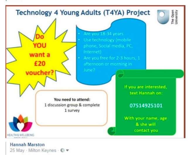
Figure 2. The amended poster and its deployment via Facebook for participant recruitment.

I'm still recruiting participants for this project that I'm running in the Pontefract Area. Focus Groups will be held from Monday 19th June (all week), mornings, afternoons & evenings (Tuesday & Thursday). If you or you know someone who is 18-34 years, free during the day or evening, & who either doesn't use or does use technology & want to get a £20 gift voucher for attending a focus group - Get in touch!!! Send me a text mgs on the number in the poster please.