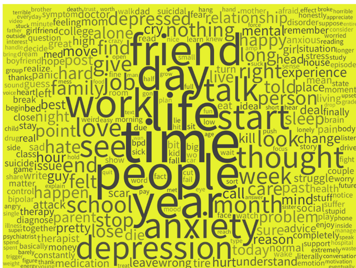
Figure 2. Word cloud of most frequently used word stems from Reddit users' post descriptions related to mental illness.