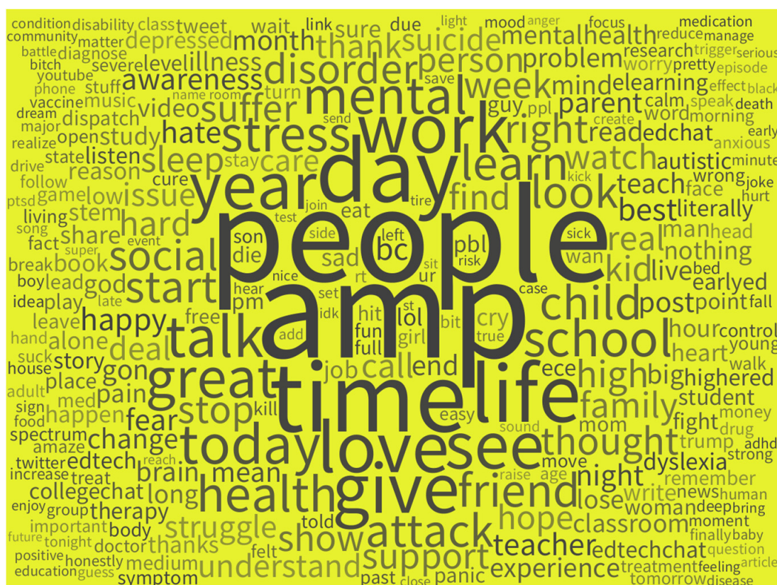
Figure 3. Word cloud of most frequently used word stems from Twitter users' post descriptions related to mental illness.