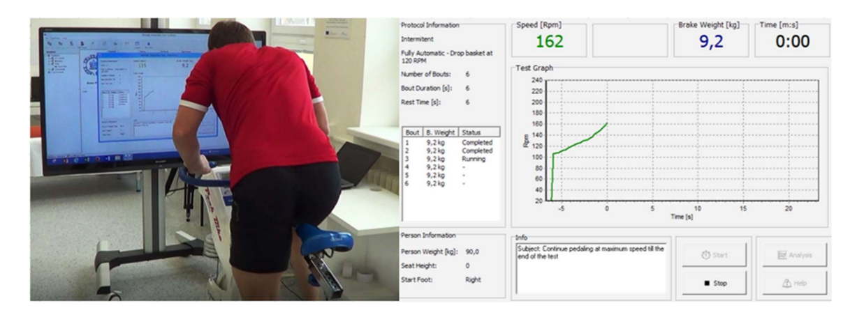
Figure 1. Testing configuration with visual feedback appearing 2 meters in front of the cycle ergometer. The participants were instructed to look at the revolution-time curve, which was adjusted to their field of vision during specific warm-up.

A 50-inch television (AQUOS, 1.35 m diagonal, Sharp Corporation, Osaka, Japan) was connected to a computer, placed 2 m in front of the ergometer's handlebars (Figure 1), and remained turned on for the CVF group, providing subjects with a full view of the revolution-time curve in addition to numerical revolutions·min<sup>-1</sup>, which represents the power output curve. The screen was readjusted to the participant's visual field during the initial test start administration. The RVF group received visual feedback only during the 2nd, 3rd, 4th and 5th stages. For the bouts with visual feedback, the participants were instructed to look at the revolution-time curve when they accelerated to start the test and during the 6 s bout. The person giving verbal encouragement controlled the status of visual feedback and provided additional instructions if visual feedback was interrupted.