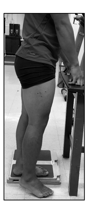
Figure 1. Standing ultrasonography collection position.

Following lying measures of LMT, LPA, and LCSA, standing measurements of muscle thickness (SMT), pennation angle (SPA), and cross-sectional area (SCSA) were collected. These methods were consistent with lying measures with one exception: for standing measures, the subject was upright and bearing weight on the opposite leg, which was positioned on a 5 cm tall platform, unweighting the measured leg and creating an internal knee angle of 160^{\circ} \pm 10^{\circ} (Figure 1). Three separate long-axis images and three separate short-axis images were saved for subsequent analysis, the same as were used for the lying measurements [9].