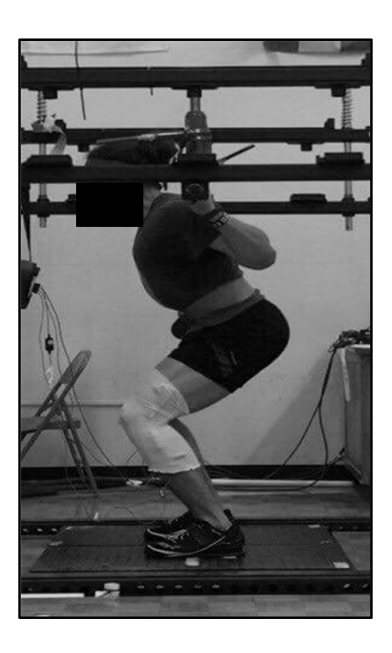
Figure 2. Isometric squat testing position.

sampled at 1000 Hz. Participants' bar height was set on an individual basis, to the point allowing the subject to have an internal knee angle of 100°, which was assessed using a goniometer (Figure 2) [20].