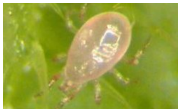
Figure 1. The predatory mite, Amblyseius swirskii.

Investigating the predation rates of the three predatory mite species ( A. swirskii , T. montdorensis , T. limonicus ) has proven all three readily feed upon the early life-stages of Bemisia . Approximately 30% of eggs were fed upon by A. swirskii following the 5 day period (Figure 2). There was no significant difference in egg consumption among the individual mites ( p > 0.05 ). However, combining T. montdorensis and A. swirskii significantly increased egg consumption ( p < 0.01 ). Predation percentages slightly decreased for all individual mite species when feeding on first instar life-stages (27%, 24%, 16% respectively) and significantly ( p < 0.001 ) decreased when feeding on second instars (8.5%, 8.5%, 8.7% respectively).