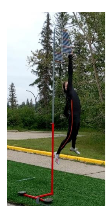
Figure 3. Photograph of a participant performing the maximum jump test.

Lastly, participants performed a maximum effort 10 m sprint acceleration. Athletes started in a stationary, self-selected stance at the starting line, accelerated forward while breaking the starting line timing gates and sprinted 10 m through the finish line timing gates (Figure 4). Sprint acceleration performance was determined as the time to sprint 10 m.