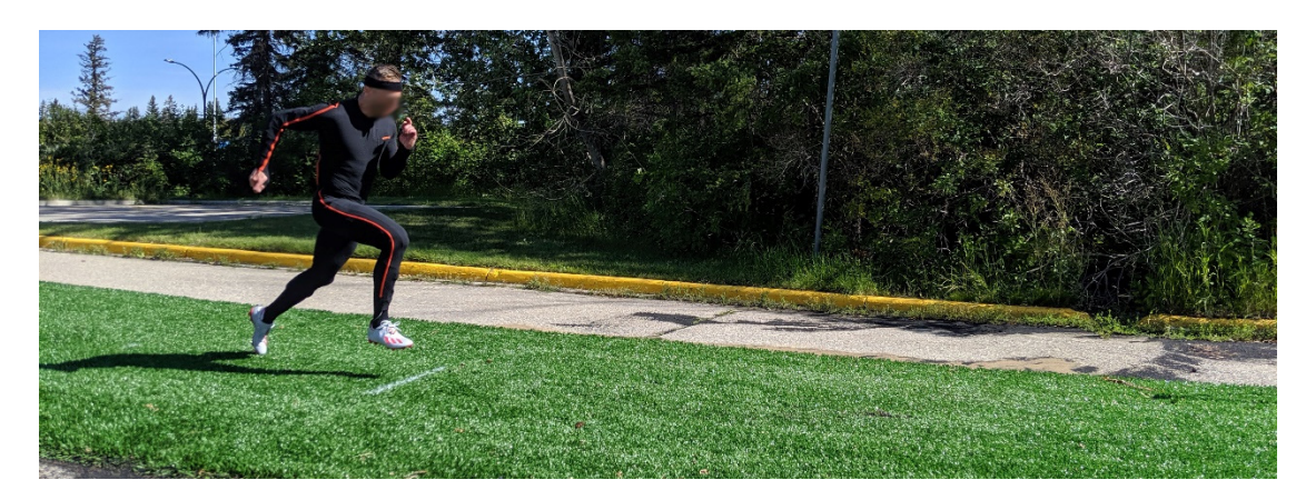
Figure 4. Photograph of a participant performing the 10 m sprint acceleration.

Lastly, participants performed a maximum effort 10 m sprint acceleration. Athletes started in a stationary, self-selected stance at the starting line, accelerated forward while breaking the starting line timing gates and sprinted 10 m through the finish line timing gates (Figure 4). Sprint acceleration performance was determined as the time to sprint 10 m.