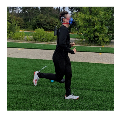
Figure 1. Photograph of test setup of the Cosmed on the artificial turf surfaces.

During the running economy session, athletes were outfitted with a Cosmed K5 breath-by-breath metabolic analysis system (Cosmed, Rome, Italy). As data was collected outdoors, a recent study has shown the Cosmed K5 to be valid for measuring submaximal gas-exchange variables in an outdoor environment [17]. Immediately before each running economy session, the Cosmed O_2 and CO_2 sensors were calibrated with a gas containing known concentrations of O_2 and CO_2 following the Matheson Certified Calibration Standard. The final calibration step involved calibrating the sampling turbine with a 3.0 L syringe (Hans Rudolph Inc., Kansas City, MO, USA) to ensure accurate volumetric measurements. When the participant was ready to begin their warmup, they were outfitted with a heart rate monitor and a breathing mask (Hans Rudolph Inc., Kansas City, MO, USA) connected to the Cosmed (Figure 1). The Cosmed calculated the volumes of O_2 and CO_2 consumed and produced at every breath and averaged these values every 10 s.