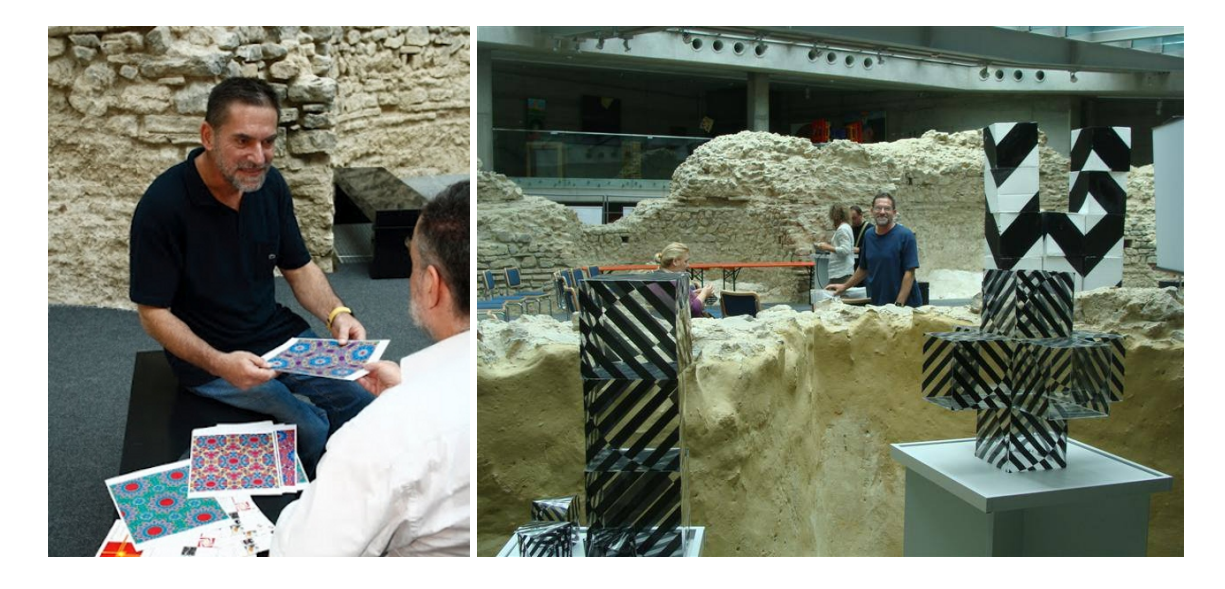
Figure 3. Slavik Jablan at the Bridges Conference in Pecs, Hungary, 2010.