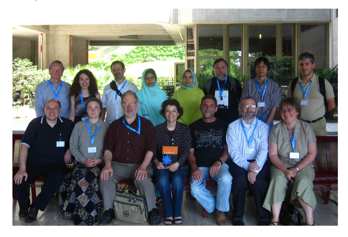
Figure 5. Advanced School and Conference on Knot Theory and its Applications to Physics and Biology, International Centre for Theoretical Physics (ICTP), Trieste, Italy, 11–29 May 2009.

any statement of relationships. This led him to make very fine conjectures (such as the Bernhard–Jablan conjecture about the unknotting number), and it made him an absolutely extraordinary collaborator. One could invent or discover some combinatorial property of knots and, the next day, send Slavik an account of the definition and ask some question about generating examples of a type or whether such and such a phenomenon might occur. He would immediately understand and put the matter to his computing system (LinKnot) and generate many examples, and the work and the conjecturing would go forward. He had a completely open mind, full creativity, devotion to art and mathematics, love of collaboration and love of friends and humanity. He was a person of value beyond words. We are going to miss him more and more as time goes on.