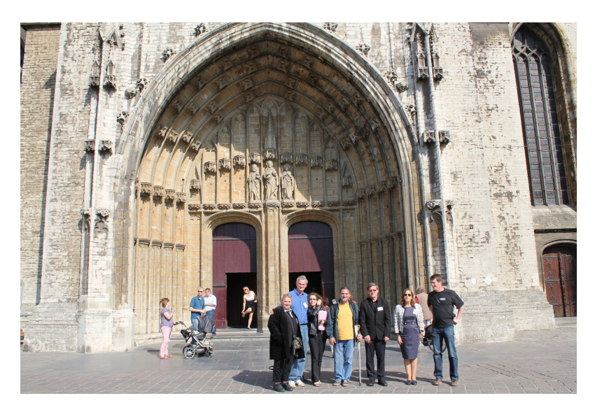
Figure 4. At the Math and Art meeting in Ghent, Belgium, 20–21 May 2011.

After a talk of mine in Israel somewhere in 1998 about the oldest mathematical object, the Congolese Ishango rod, we engaged in a discussion about this object. We did not entirely agree, but on the contrary, that was not a problem. Later, in 2007, he would even come to my conference "Ishango, 22000 and 50 years later: the cradle of mathematics?" at the Flemish Royal Academy of Belgium. Additionally, in 2013, a contribution by his hand, entitled "A Second Opinion on the Ishango Rod", would be a part of a chapter in my book "Belgium + Mathematics". This genuine interest he had for Africa was also confirmed in a kind of expedition we held in Buenos Aires, Argentina. Someone informed us that an Argentine citizen had a large collection of Congolese fabrics that he did not exactly know what to do with and how they should be grouped together, and for some reason, he did not want to follow the official steps. Yet, we went to visit him, took numerous pictures and crowned the expedition with a paper on a group theory classification of Congolese fabrics in Buenos Aires. Mathematics combined with adventure, and that was fun.