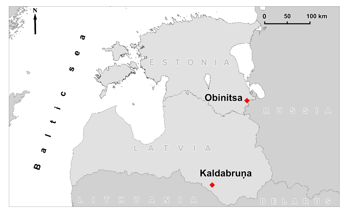
Figure 2. The case study areas of Obinitsa, Estonia, and Kaldabruṇa, Latvia.

Obinitsa and Kaldabruṇa (Figure 2) were also chosen due to their remote location, far from larger settlements. They provide an opportunity to understand the problems rural areas face when they are insulated from urban influences. Obinitsa is situated in the Setomaa municipality in Võrumaa (county), where Võru, the nearest town, is 30 km away. Kaldabruṇa is situated in the municipality of Rubene Novads, and the nearest city of Daugavpils is approximately 48 km away. Obinitsa has 160 inhabitants, and Kaldabruṇa has approximately 100.