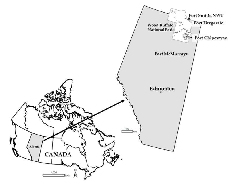
Figure 1. Study area including key communities involved in the project, and the Wood Buffalo National Park, Canada.