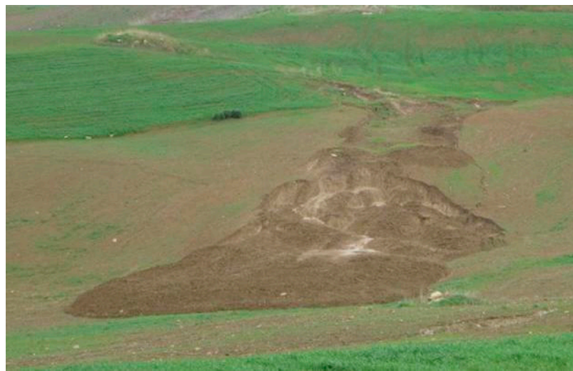
Figure 2. View of the surveyed area.

The surveyed area is located at an altitude between 500 and 700 m a.s.l. (Figure 2).