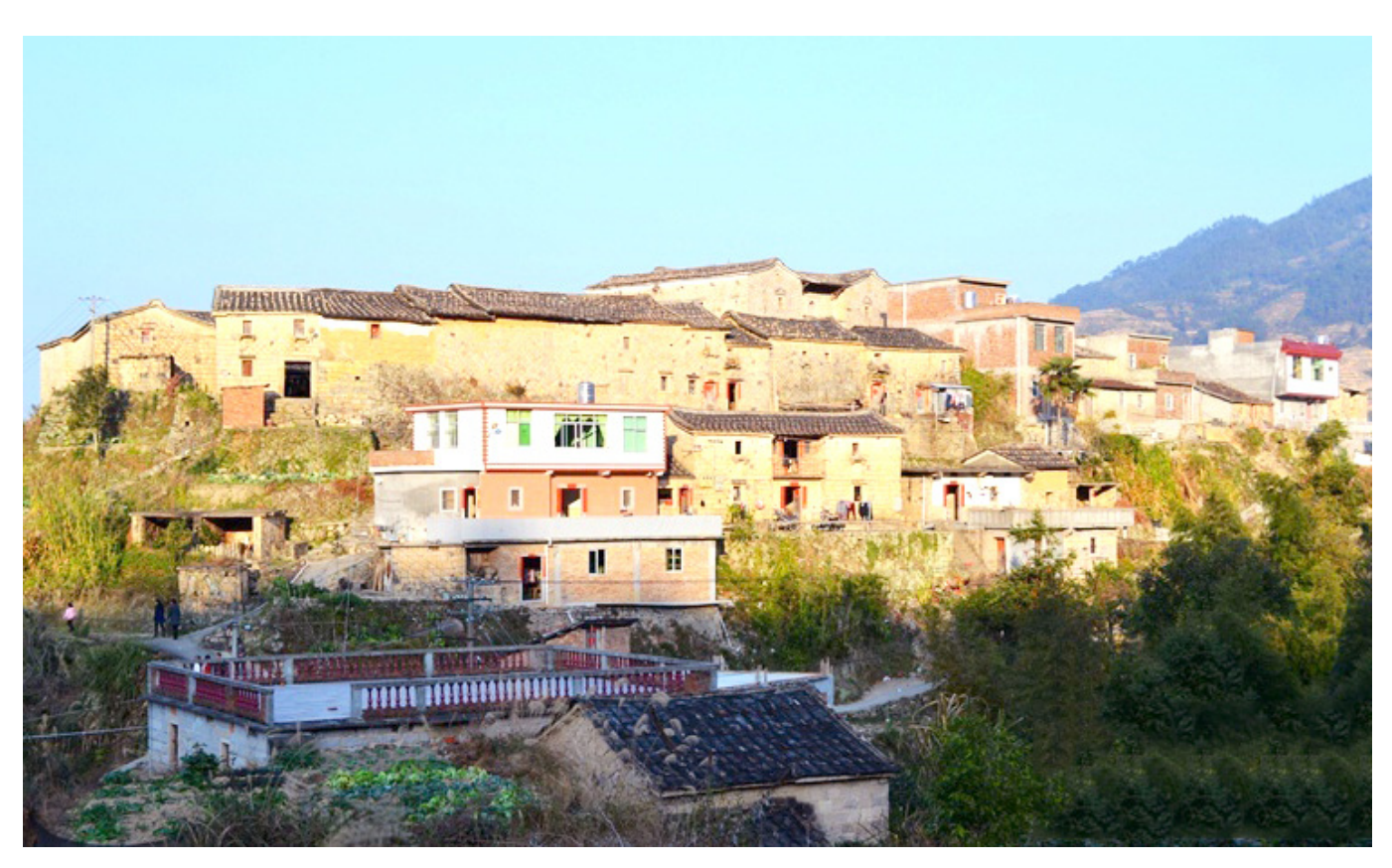
Figure 2. Traditional architecture and agricultural landscape of "Yuezhai" in Xiping.