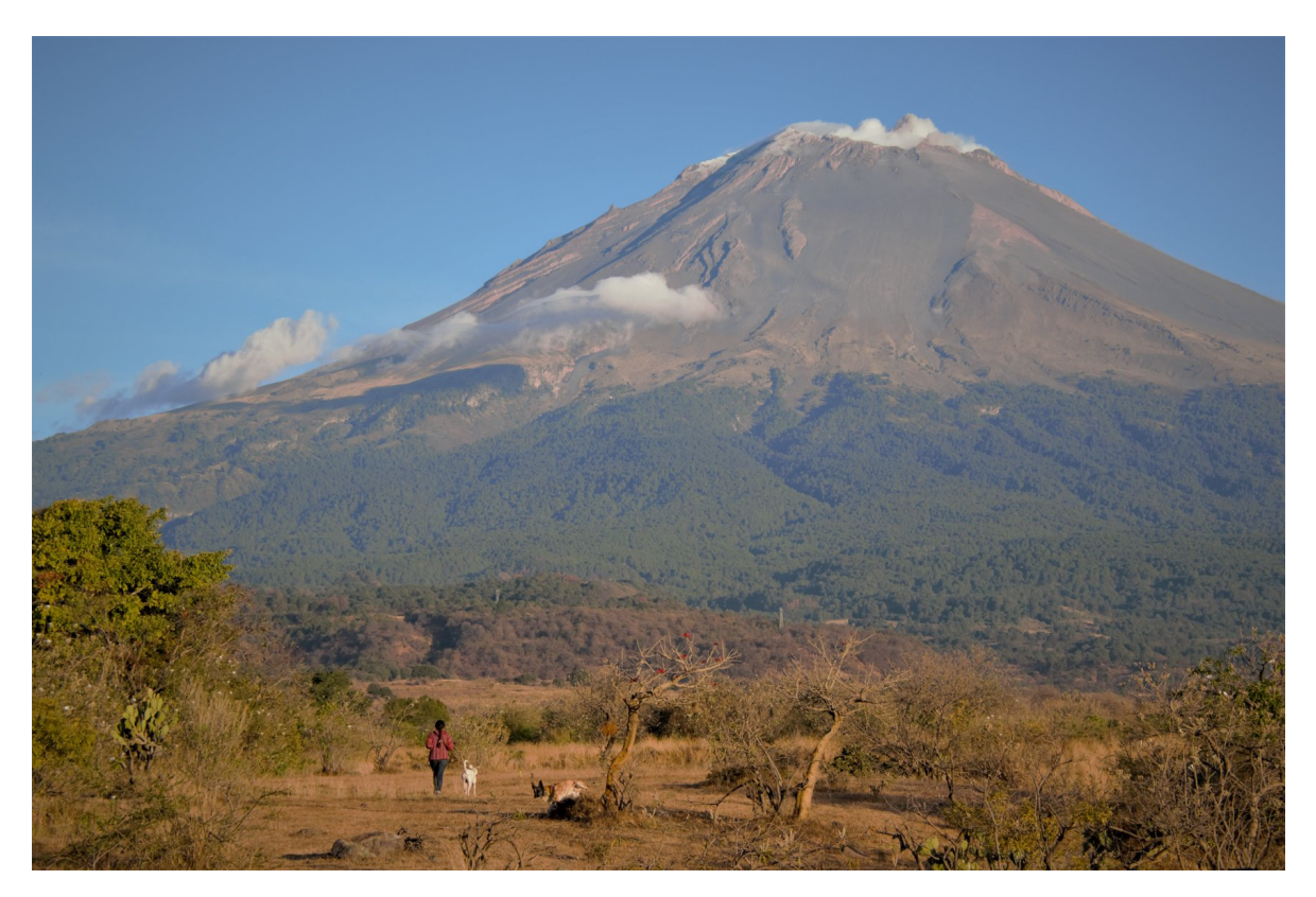
Figure 1. A traditional Mexican landscape with the mighty Popocatepetl Volcano on the background.

This is the context where bachelor students in architecture were introduced to planning and design of culturally and patrimonial relevant landscapes. However, intervening in landscape components, conservation, and planning is not an easy task when facing the challenges emerging from up-down land policies, linear spatial planning, aggressive urban planning, week environmental regulations, lack of implementation, and feedback, etc. Thus, through architectural studies we have a unique opportunity to recognize landscape narratives from a bottom-up stance and to learn to tackle planning issues, through sensitizing the future decision makers in land management and spatial planning.