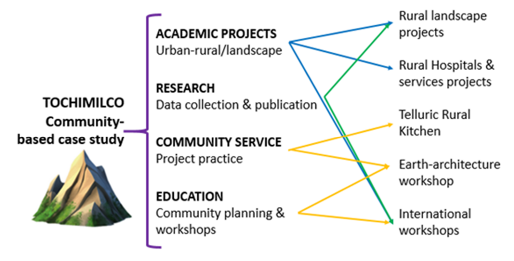
Figure 3. Collaborative stage and community-based approach.