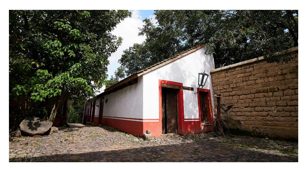
Figure 5. Vernacular architecture with avocado orchards at Finca Mariana y Marcos Tochimilco.