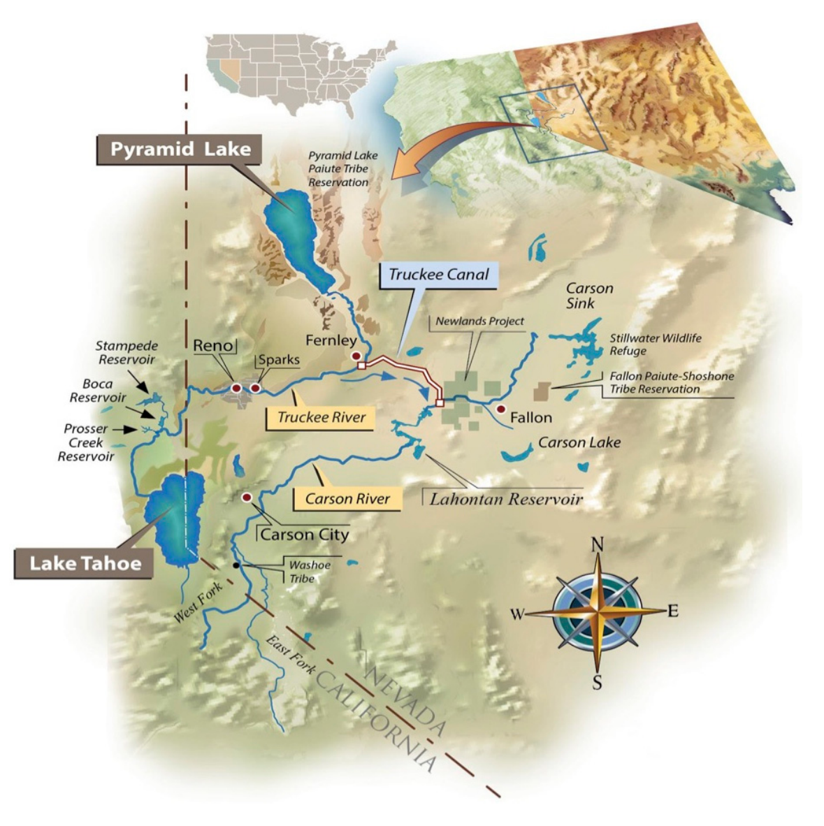
Figure 1. Truckee-Carson River System.

The Carson River also originates in the eastern Sierra Nevada as snowpack. Within the 10,270 m<sup>2</sup> area basin, nearly 15% of the total area is located in eastern California, while 85% is located in northwestern Nevada [31]. As with the Truckee River, a federal compact regulates interstate resource sharing. The Carson River involves the oldest litigation over water right adjudication in the United States, with one case alone spanning 55 years, and resolved through the Alpine Decree (1980), which today is the primary governance regime over that river's water rights allocation [31]. Since 1915, its waters have been captured and stored in Lahontan Reservoir to supply additional agricultural irrigation water for the Newlands Project downstream and surrounding rural communities [30].