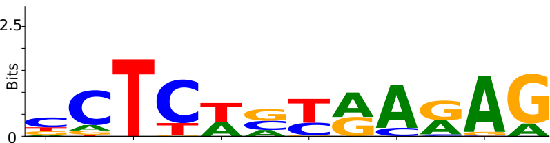
(A) Novel Repressors