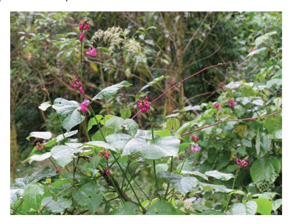
Figure 2. A population of P. costaricensis (#3246) found in the buffer zone of Chirripó national park in San José province of Costa Rica in December 2012.