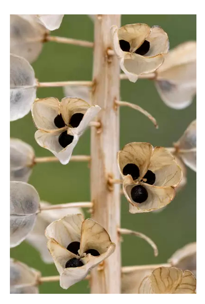
Figure 2. Dried inflorescence of M. bourgaei with seeds.