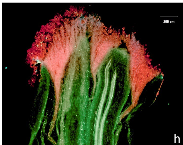
Watermelon ( Citrullus lanatus (Thunb.) Matsumara & Nakai)