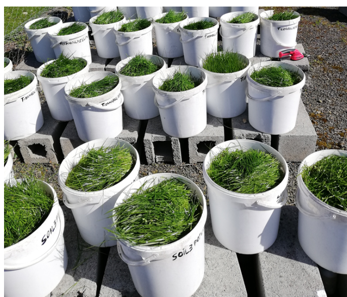
Supplementary Figure S1: Modified lysimeter set-up