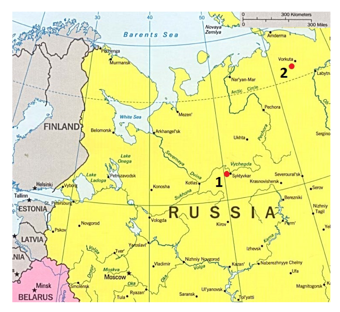
Figure 1. Locations of the sampling points of the taiga (1), and the tundra (2) zones.

All Retisols under study are in the taiga zone. Virgin plots of Eutric Albic Retisol and Eutric Albic Histic Retisol were located on the catena. The high position of the catena in the relief made it possible for us to evaluate the impact of the moisture degree on the paramagnetic properties of HSs. The virgin soil plots are located at the Maksimovsky Soil-Ecological Station of the Institute of Biology. The Eutric Albic Retisol plot is eight km to the west of Syktyvkar, on the top of the watershed hill. The plot of Eutric Albic Histic Retisol is 100 m apart from the latter. It is a micro-depression between low and flat hills.