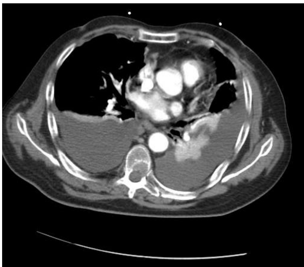
Figure 3. Angio CT-scan showing the metastatic lesions from GBM in the left inferior lobe and in the pleural cavity.

An autopsy ruled out a secondary primary tumor site. Post-mortem examination of the CNS did not reveal any lesions other than the initial tumor of the left temporal lobe. The whole-body autopsy also reported diffuse metastasis in the lung, the pleural cavity, and the mediastinal lymph nodes and in the liver. No other primary tumor was detected.