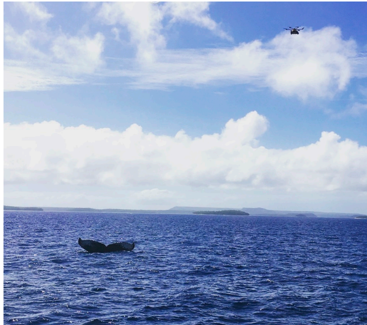
Figure 4. HexH2O™ has been used to observe the behavior of humpback whales in their Tongan breeding ground around the Vava'u archipelago [54].

limited (approximately 12 min). In addition, the small size of the sealed unit allows little further implementation. To address this issue, Auckland University of Technology (AUT) is currently testing a waterproof hexacopter (HexH2O™, Figures 3 and 4) as a tool to investigate the behavior of bottlenose dolphins ( Tursiops truncatus ) [53] and humpback whales [54].