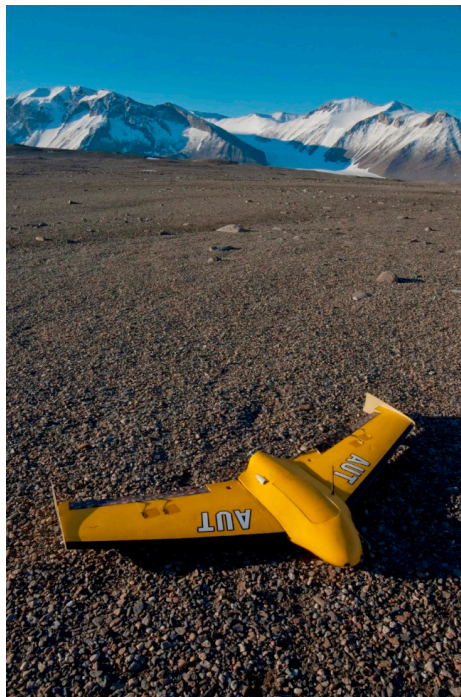
Figure 2. PolarFox UAV (Skycam UAV Ltd., Dunedin, New Zealand) can be hand launched with a bungee cord. It is equipped with a parachute for landing [44].

Several authors have proposed the use of short endurance fixed-wing RPA or LASE UAS (Figure 2) as survey platforms in open areas for big land Mammals (e.g., [37–39]), reptiles (e.g., [16]), and birds (e.g., [40–42]). In spite of their short endurance (generally 40–90 min), LASE UAS present several advantages with respect to long endurance systems or LALE UAS. Their price is significantly lower, with the average cost of a complete system, including the launching device and the GCS, being currently approximately $20,000 (US$). Some RPA can be hand-launched (e.g., [37,39,43,44]), as the airframe has a take-off weight lower than 5 kg. Most of the aircraft land on their belly and thus require runways. Web-retrieving systems have been developed for rear-propulsion aircraft, as belly-landings strongly reduce the airframe lifespan [38] and runways can be dangerous for bystanders [45]. Such retrieving webs can fit on vessels and, therefore, allow an extension of the UAS operation range [35]. Another advantage with respect to long endurance UAS is the propulsion system. Electric brushless motors require less maintenance than fuel-powered engines [45], and are far quieter. The electric power, however, limits these aircraft. Advances in materials used for lithium batteries (e.g., [46,47]) may significantly improve the flight duration although, at the present time, the gain of weight resulting from carrying high capacity batteries often offsets the gain in endurance.