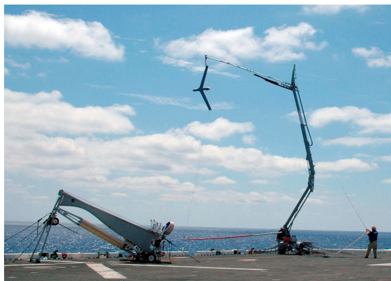
Figure 1. ScanEagle® unmanned aerial vehicle (UAV) (Boeing Insitu, Bingen, WA, USA) lands on skyhook for recovery. The SuperWedge® pneumatic launching catapult (left) can be mounted on vessels.