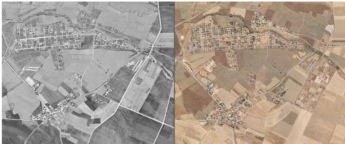
Figure 3. Municipality evolution: (left) 1990; and (right) 2011 (Source: Torrearte Municipality 2013).