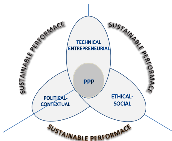
Figure 2. PPP Working with People (WWP) model.

During the different phases of the PPP project cycle, the Torrearte planning team provides technical advice for the proposal's final design, and it then gets channeled to the different sources of existing resources (PAMAM, MANCOMUNIDAD, Local Action Group GALSINMA and other Businesses). Teamwork, negotiation and communication skills are thus central to effective EPMC, as is an appreciation of the political context within which decisions are being made. The resources obtained from the approved projects are given entirely to the beneficiary of such project. EPMC provides an overall analytical and decision making framework, complemented by the application of other specific "technical" and "process" tools. This EPMC of operations for managing entrepreneurial projects has five phases, as shown in Figure 2 below. Figure 3 shows the municipality's evolution from the year 1990 to 2011.