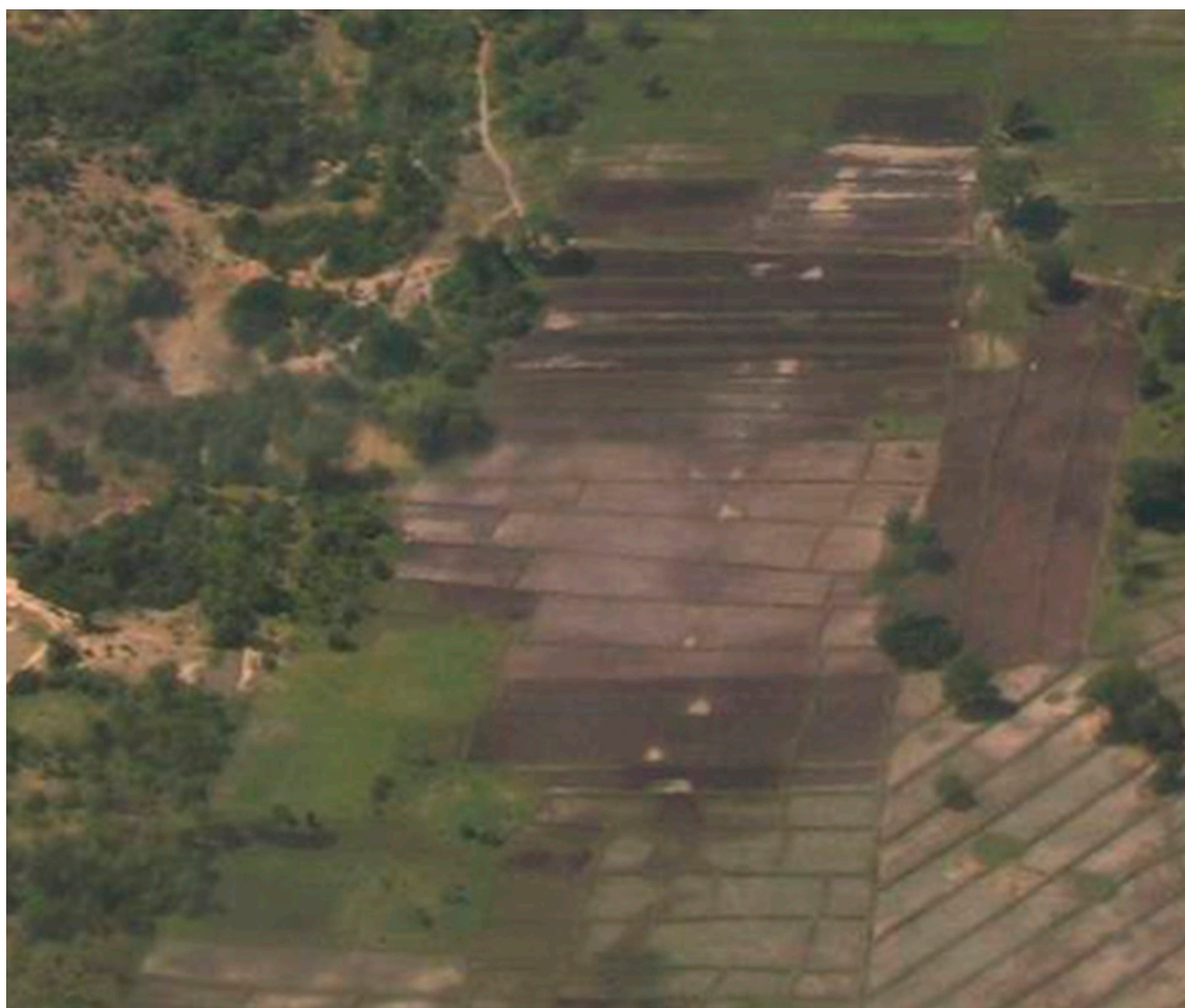
Figure 3. Aerial photograph of rice paddies after harvest in Tanzania. Difference in soil color in the middle of the fields is indicative of variation in soil nutrient availability within rice paddies, which is caused by the movement of biomass to the middle of the field during threshing.

Biomass removal is a common practice in smallholder systems where weeds and crop residues are uprooted from the farm field and tossed to the field edges. Relocation of this biomass translates to relocation of valuable nutrients and organic matter to the field edges and nutrient mining in the middle of the farm fields. In contrast, rice threshing often occurs in the middle of the drained paddy, which concentrates nutrients (mainly K) in the center of the field (Figure 3).