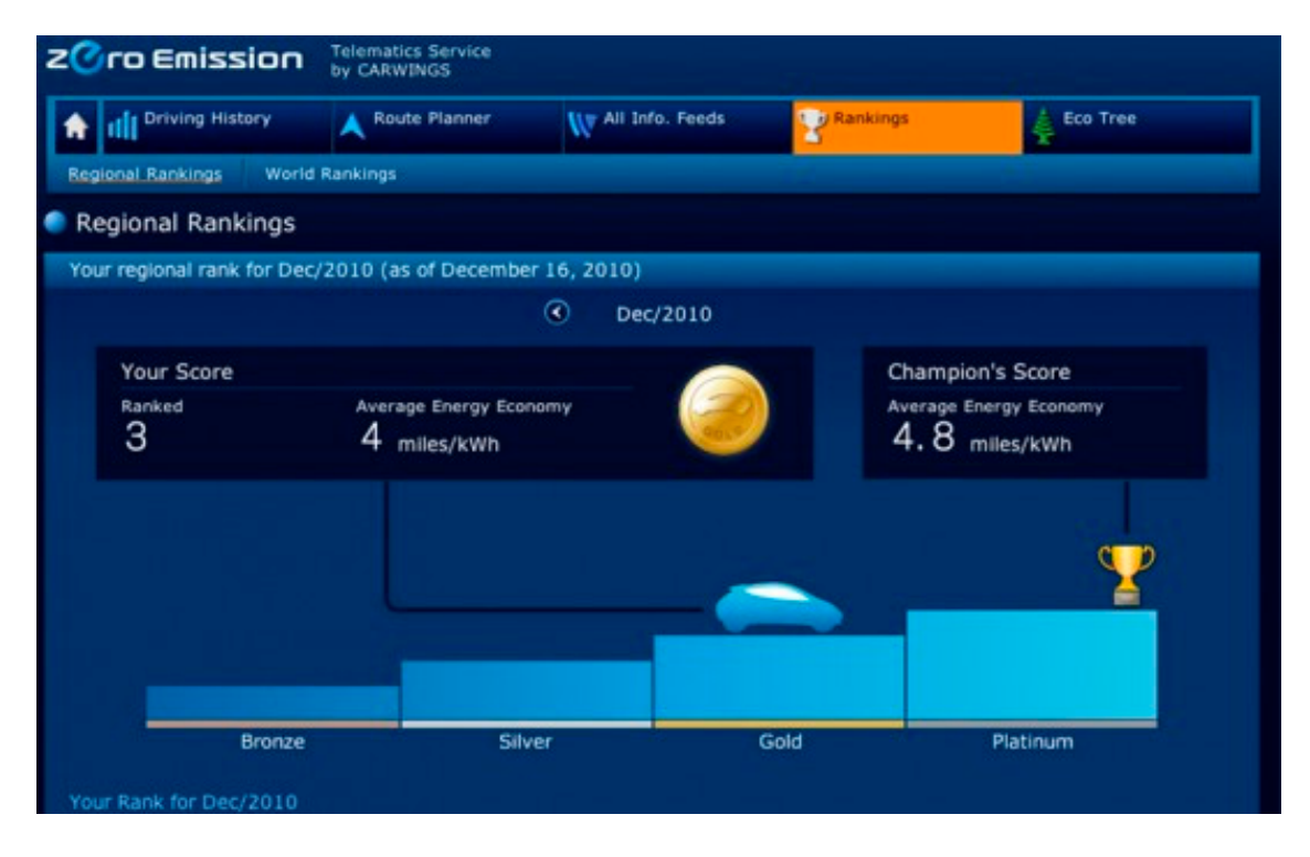
Figure 2. Nissan Leaf.

The Leaf is an all-electric vehicle manufactured by Nissan. In most aspects, Nissan Leaf is very similar to a conventional gas vehicle. The major difference with a conventional gas vehicle is a limited range of driving due to the electric battery capacity. In Nissan Leaf, the Eco Mode software tracks several variables related with energy consumption [7]. The Eco Mode software monitors accelerator pedal operation, brake pedal operation, driving conditions, traffic conditions, heater and air conditioner usage, the time when the vehicle is not moving while it is ready to go. As shown in Figure 2, a display behind the steering wheel provides a feedback of energy efficiency. The level of energy efficiency is shown by providing tree symbols. It also provides online profiles which describe a ranking compared to others.