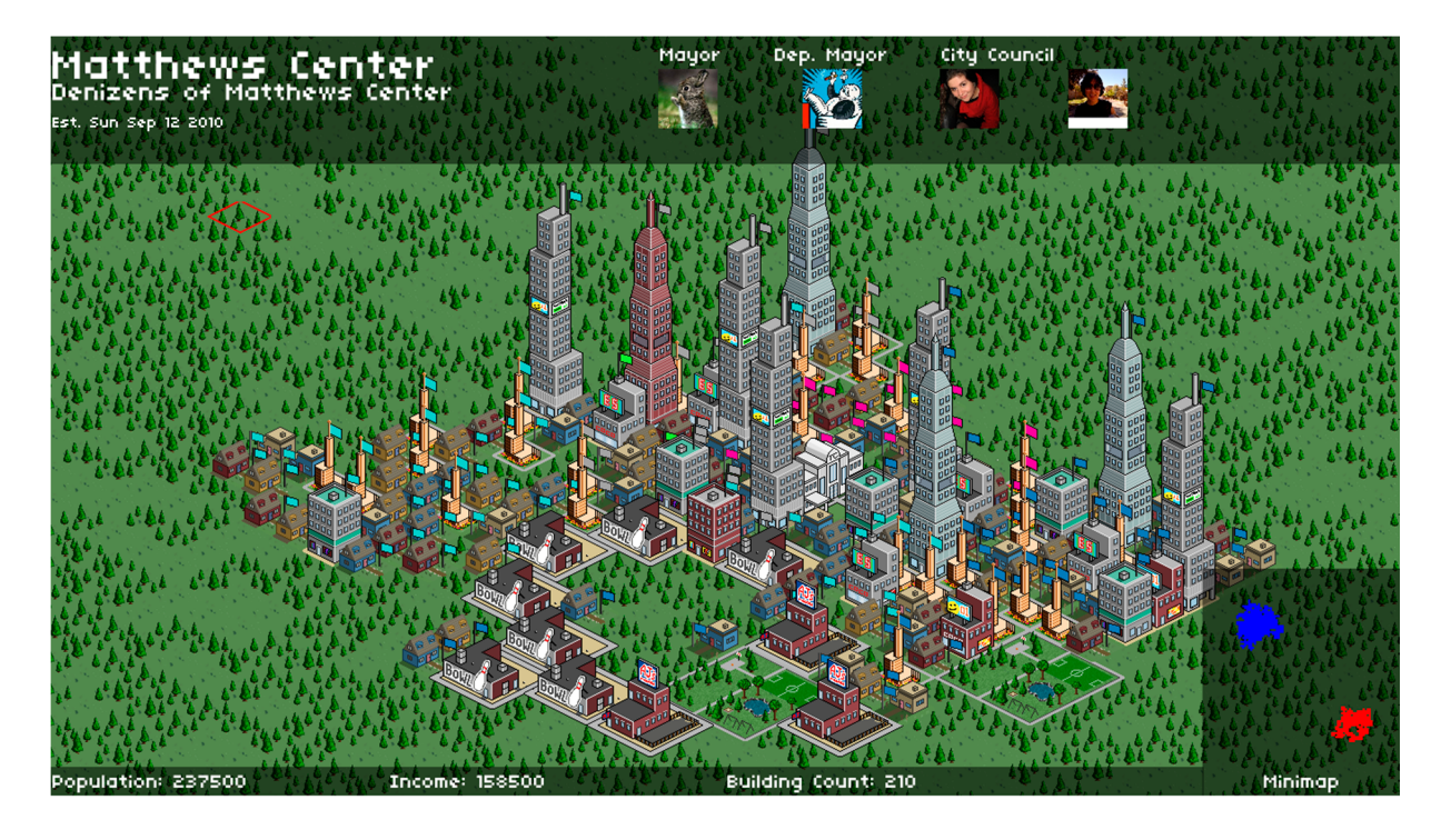
Figure 4. Taskville.