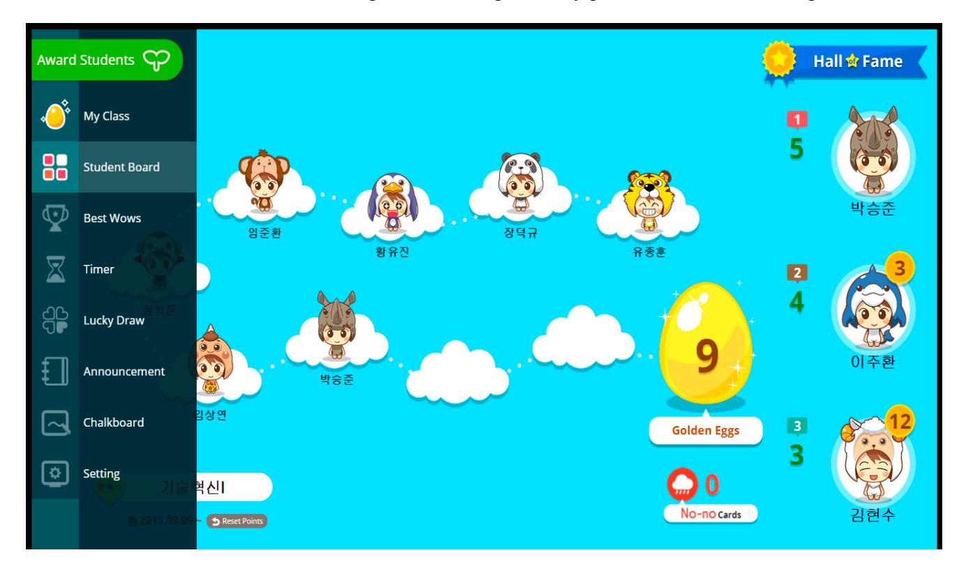
Figure 1. Class123.

Class123 is a gamified application for school teachers which effectively manages students' behavior in classroom and transparently shares students' daily lives with their parents [6]. It consists of a PC web service and a mobile web/app service for teachers, parents, and students. A teacher can collect students' behavioral data and deliver feedback to students quickly and easily from both computers and mobile devices. As shown in Figure 1, a classroom PC or TV becomes a live leader board presenting students' gamified avatars and feedback animations. Teacher's mobile device becomes a remote controller for this leader board. With Class123, teachers can share behavior reports and announcements with parents and students, as well as communicate with parents to cooperatively promote students development.