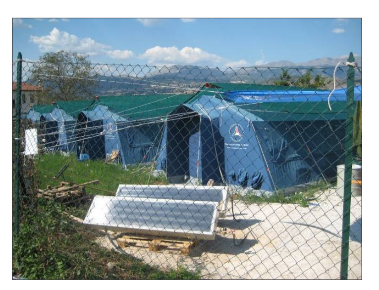
Figure 7. Solar thermal plant in Coppito camp.

In Coppito camp, the second commercial plant was installed: a natural circulation system composed of five collectors, supplying DHW to the shower and the kitchen, as shown in Figure 7.