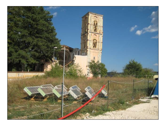
Figure 9. Thermal solar plant in Santa Rufina camp.

Regarding the post-emergency phase , 10 solar systems were installed in camps: 47.5 m^2 of solar thermal and 50 m^2 of photovoltaic systems, during 6 months of activities.