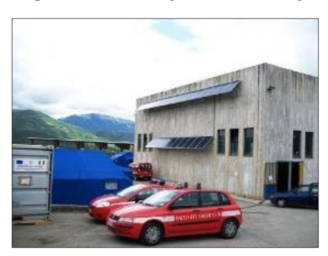
Figure 8. Photovoltaic plant in Pizzoli camp.

The tender has to be seen in the framework of many other activities implemented by CIRPS after the earthquake and directed to deal with energy supply problems in the emergency, with affected population awareness of a more sustainable reconstruction and the cooperation between all relevant local actors in order to promote an institutional and political environment fitted for the purpose. One hundred and fifty solar thermal panels have been donated to the affected communities of Abruzzi.