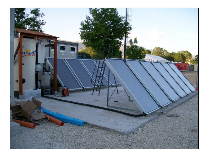
Figure 2. Solar thermal plant in Fossa (AQ).

In this context the first intervention of CIRPS took place, meeting the requirements coming directly from the displaced population. 15 days after the earthquake, the first solar thermal plant of 20 \text{m}^2 was installed in Fossa camp and people could have the necessary hot water to live better their "new" lives—see Figure 2.