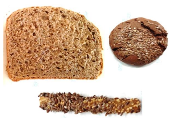
Figure 2. Representative photos for the three functional bakery snacks.

for breadsticks) to indicate that their fate in the market could be successful from a sensorial point of view.