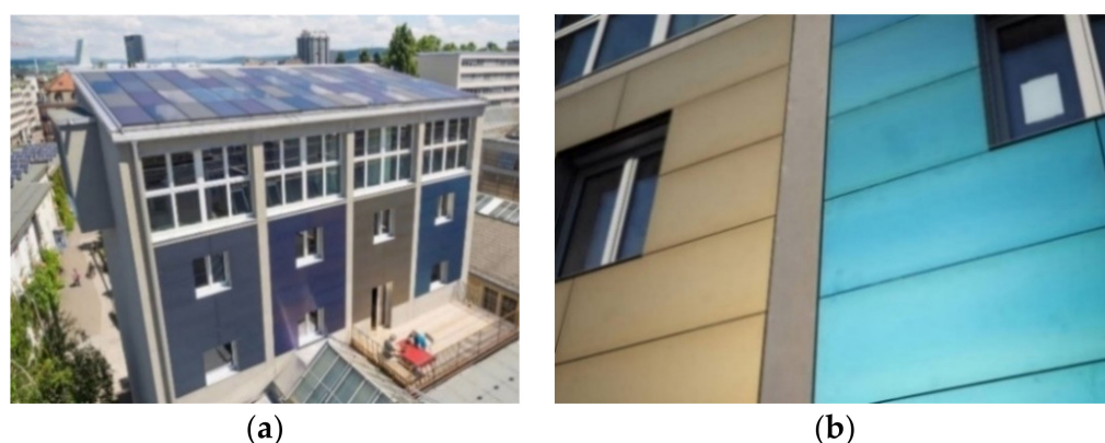
Figure 3. Solar Silo: roof-integrated and façade-integrated BIPV (a) and façade BIPV system detail (b). Detailed information available online: https://www.hiberatlas.com/en/solar-silo-in-gundeldinger-feld-basel--2-51.html (assessed on 18 February 2021).