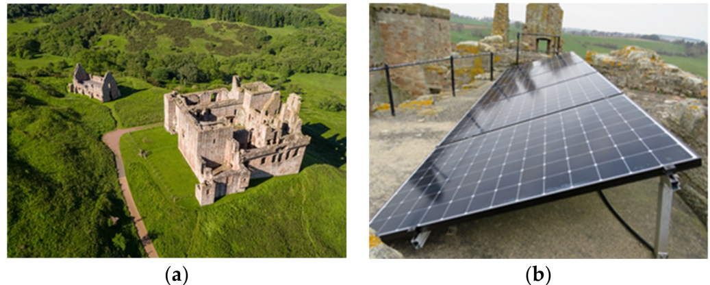
Figure 2. Crichton Castle and surrounding landscape (a) and the view of the solar panels on one of the towers (b). Sources: © Historic Environment Scotland. More information available online: https://blog.historicenvironment.scot/2019/04/here-comes-the-sun/ (assessed on 18 February 2021).

on one of the castle towers. Due to the nature of the site, the panels were located in such a way, that they are not visible from the ground. This was important since the ruin is a prominent feature in the wider landscape. Cables were run within the walls where possible, or otherwise fixed into the mortar joints. The solar panels installed had a maximum output of 1.0 kWp, enough power for most needs but not enough to run the space heater. The generator was still required during the early spring and late autumn when more heating was required. In 2019, it was decided to upgrade the panels to newer models with an output of 1.8 kWp but retaining the existing fixings and cable routings. New batteries also enabled the storage of the energy as needed. With these improvements, 100% of the energy requirements can now be met with renewable energy (Figure 2).