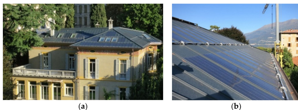
Figure 4. Villa Castelli: roof-mounted BIPV (a) and system detail (b). Detailed information available online: https://www.hiberatlas.com/it/villa-castelli--2-23.html (assessed on 18 February 2021).