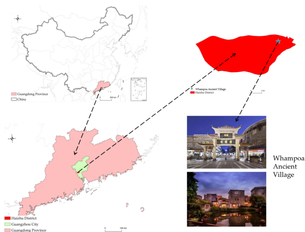
Figure 2. Whampoa Ancient Village.

Whampoa Ancient Village (WAV) is located in the east of Haizhu District, Guangzhou, Guangdong Province, China, close to the Pearl River (see Figure 2). It is one of the originating ports of the China Maritime Silk Road and plays an important role in the history of China's shipping.