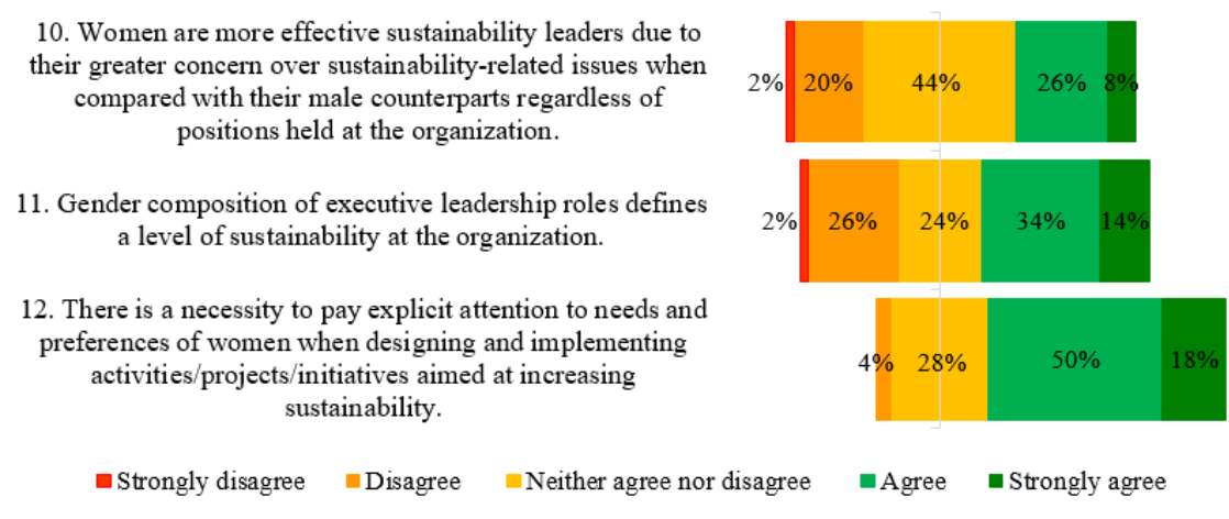
Figure 4. Results for gender statements.

The neutral to strongly disagree position of most respondents on women as better sustainability leaders could be explained by one or more of such factors as the still prevailing stereotype on women's abilities as leaders [63,71]. Women on leadership positions leaders consider their experience being leaders as gender-neutral based on merit and hard work [92], organizations do not emphasize gender nature of sustainability achievements, and there is very limited dissemination of studies on women in managerial positions as drivers to better organizational performance, including sustainability [63,64,68,93].