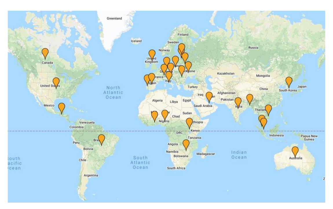
Figure 2. Participating countries.

The survey was answered by 50 leaders from 29 countries (Figure 2): United Kingdom, United States, Latvia, Germany, Brazil, India, Ukraine, Uganda, Nigeria, Vietnam, Austria, Zimbabwe, Guatemala, Australia, Malaysia, Canada, Bangladesh, Ghana, Romania, Belarus, Portugal, Spain, Republic of Korea, Qatar, Italy, Poland, Switzerland, Singapore, Estonia. The country with the highest number of respondents was the United States, with eight answers.