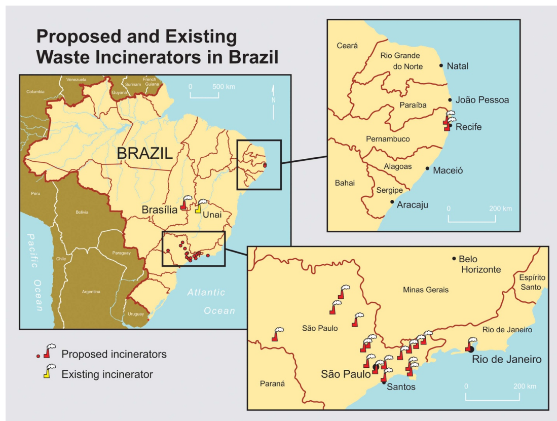
Figure 1. Proposed and existing waste incinerators in Brazil.