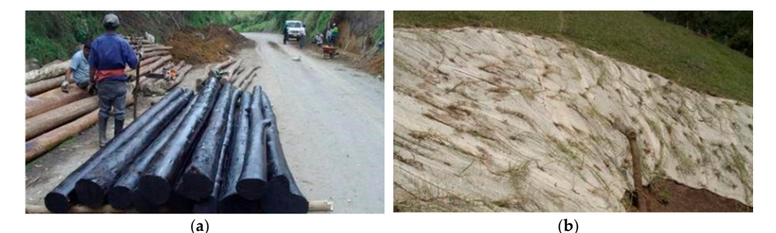
Figure 13. (a) Logs of Eucalyptus after borate treatment (Petrone, 2010); (b) Reconstruction of vegetational cover with fabrics of Agave or Sisal and plantation of herbaceous' rhizomes (Petrone, 2010) (Colombia).

For five techniques (17%), data regarding the used wood are missing, for the construction of 22 (73%) techniques, Eucalyptus was used. In a number of cases the Eucalyptus was treated to be long-lastingly preserved and to increase the durability of the recently cut logs (Figure 13a). Due to missing alternatives, the choice for Eucalyptus (allochthonous and widespread species) resulted in an obligatory decision. Wooden logs were also used in 19 construction sites. In 13 cases (68%) data regarding the type of wood are missing, for the remaining ones Eucalyptus or Bamboo has been used.