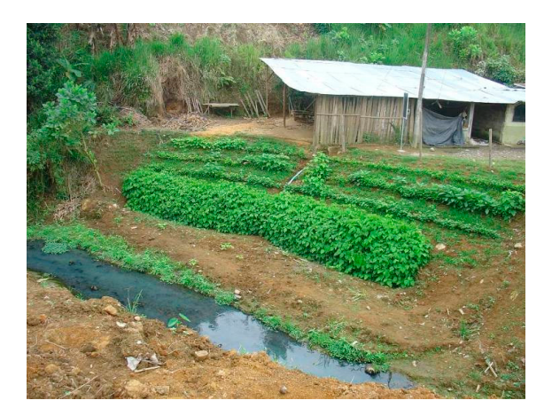
Figure 6. WBE construction at La Isla in Santo Domingo after the finalization in 2010. (Petrone, 2010).

(5) In the district of La Isla in Santo Domingo (Ecuador) a river consolidation work was constructed in 2010 by implementing a living wooden double crib wall for riparian protection and hedge brush layers on the upper part of the slope (Figure 6). In 2012 the construction was found in perfect condition. The inert material used (crib wall) had maintained its functionality for 2 years, the erosion process was completely halted, and the area had recuperated environmentally. A high percentage of the placed cuttings survived. In 2012, the approximate lifespan of the inert part of the work was estimated at 5 to 10 years. No damage was reported during the course of the monitoring. In 2018 the construction was not found due to incorrectly noted coordinates, therefore no information regarding its development since 2012 or the current condition of the construction are available at this time.