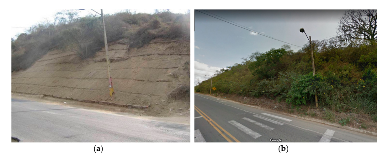
Figure 5. Soil bioengineering (SBE) construction at Jipijapa ( a ) after the finalization in 2008; (Petrone, 2008) ( b ) monitoring in 2018 (Google Streetview, 2018).

time. Further, in the lower section down by the street, garbage was found along the whole construction site which is presumably influencing the vitality of the plants in this section. As already predicted during the monitoring procedure in 2012 the wooden logs of the construction were decomposed to a large degree and the plants had taken over the stabilizing function. The aim to stop the erosion of the slope was achieved based also on the carefully chosen measurements for the project.