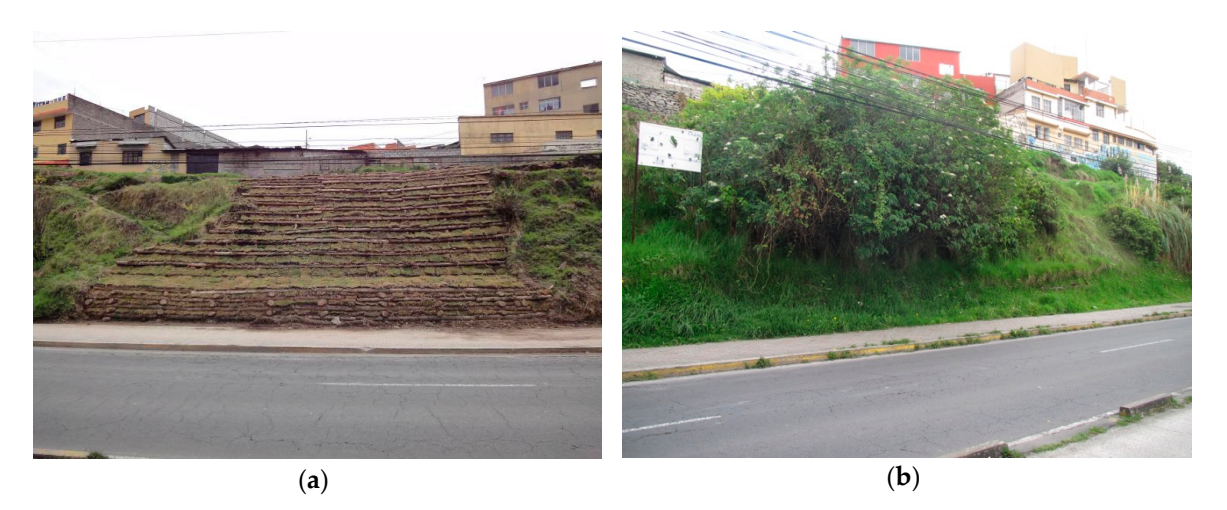
Figure 4. SBE construction at Av. Maldonado in Quito ( a ) after the finalization in 2012 (Petrone, 2012); ( b ) monitoring in 2018 (Maxwald, 2018).

(3) In 2012 (7) a 16 m long and 10 m high soil bioengineering intervention was implemented on a slope at the street Av. Maldonado in Quito (Ecuador) (Figure 4). At the base, a wooden triangular ("latino") crib wall was constructed. Over the upper part of the slope a living wooden grid and a new sward using sod slabs ("chambas de kykuyo") were implemented. Monitoring of the vegetation was undertaken 3 months after the construction. The development of the plants was satisfactory, and the construction was in good condition. In 2018 the crib wall at the base showed signs of decay. The sods developed well, covering the crib wall and the wooden grid. Further, the implemented vegetation grew in a satisfactory way and was able to take over the stabilizing function at the slope.