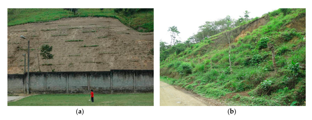
Figure 11. SBE construction at San Miguél ( a ) after the finalization in 2010 (Petrone, 2010); ( b ) monitoring in 2018 (Maxwald, 2018).