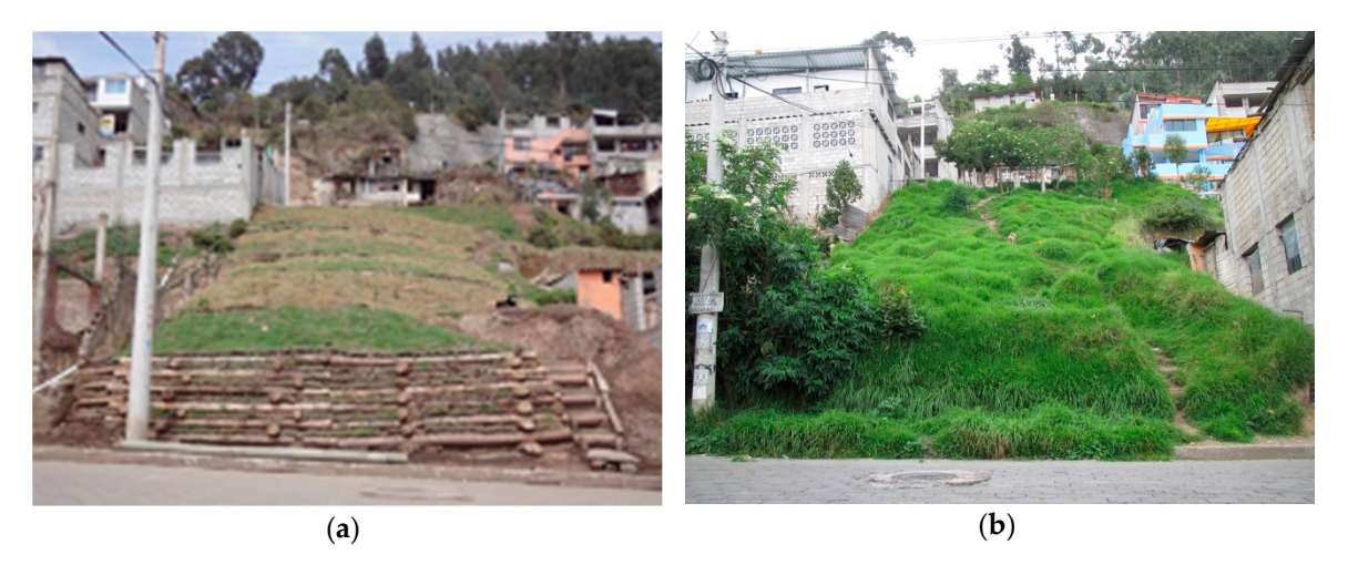
Figure 9. SBE construction in San Luis de Chillogallo in Quito ( a ) after the finalization in 2012; (Petrone, 2012) ( b ) monitoring in 2018 (Maxwald, 2018).