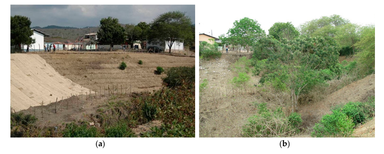
Figure 10. SBE construction at Membrillal ( a ) after the finalization in 2008 (Petrone, 2008); ( b ) monitoring in 2018 (Maxwald, 2018).