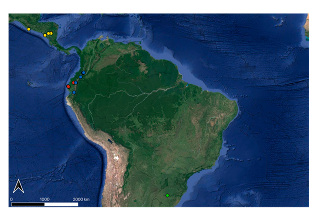
Figure 1. Locations of described soil and water bioengineering constructions.