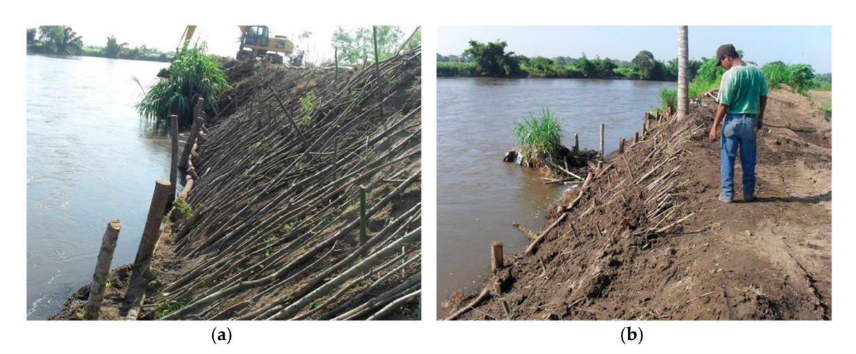
Figure 3. WBE construction at La Nueva Concepción ( a ) single walled crib wall at the base and living branches at the slope (Petrone, 2009); ( b ) after the finalization in 2009 (Petrone, 2009).

(3) In 2012 (7) a 16 m long and 10 m high soil bioengineering intervention was implemented on a slope at the street Av. Maldonado in Quito (Ecuador) (Figure 4). At the base, a wooden triangular ("latino") crib wall was constructed. Over the upper part of the slope a living wooden grid and a new sward using sod slabs ("chambas de kykuyo") were implemented. Monitoring of the vegetation was undertaken 3 months after the construction. The development of the plants was satisfactory, and the construction was in good condition. In 2018 the crib wall at the base showed signs of decay. The sods developed well, covering the crib wall and the wooden grid. Further, the implemented vegetation grew in a satisfactory way and was able to take over the stabilizing function at the slope.