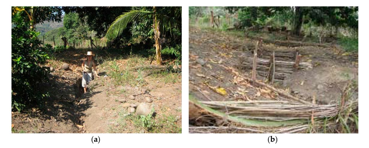
Figure 7. SBE construction at Jacomulco ( a ) gully in 2009; (Talamantes P., 2009) ( b ) after the finalization of the work in 2009 (Talamantes P., 2009).

(7) In 2010, an 80 m long and 7 m high WBE construction was implemented at a riverbank in the municipality of Santa Cruz do Sul (Province Río Grande do Sul, Brazil) (Figure 8). The erosion appeared after the construction of a dam what modified the section of the river. The intervention's aim was to restructure the slope through physical and ecological restoration using WBE techniques, such as vegetated riprap, living palisades, anchoring of living and dead tree spurs, as well as the implementation of rooted shrubs and cuttings.