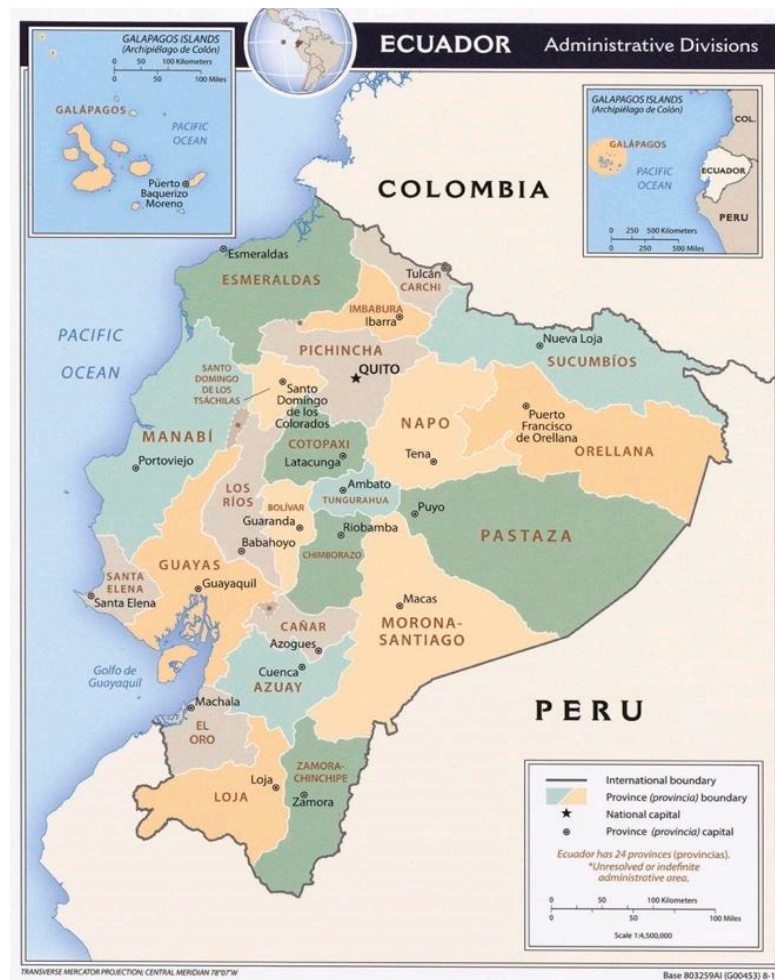
Figure 1. Map of Ecuador, Administrative Divisions [27].

The Ecuadorian coast is characterized by an agro-export economy based on large plantations of varied production. In order to meet the demand of national and international markets, the coast is extensively cultivated with important products such as banana, coffee, cocoa, rice, soybean, sugar cane, cotton, and a diversity of fruits and other tropical crops [28]. Mangroves and the marine environment are critically sensitive habitats for fish and crustaceans, which are sustainably managed by small fishermen who benefit from the abundance of these natural populations. Furthermore, hundreds of people work on shrimp farms, with shrimp being one of the main exported resources; such farms occupy over 126,000 hectares of coast.