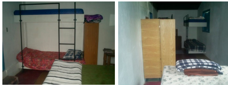
Figure 2. The inside of the rooms. Pousado dos Paula.