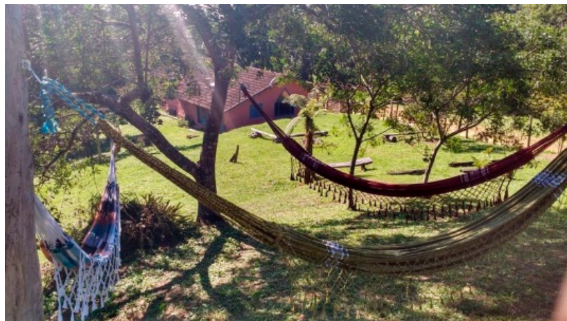
Figure 6. Hammocks at Pouso dos Paula.