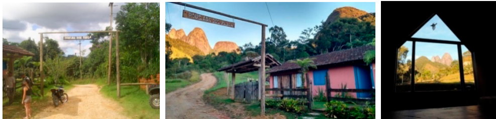
Figure 4. Entrance gate and a window at Pouso dos Paula.

be watched because only elected individuals could pass through them. Just as the gate at Pouso dos Paula announces nature, a window (with a different shape and size) frames the iconic nature of the Serra dos Três Picos.